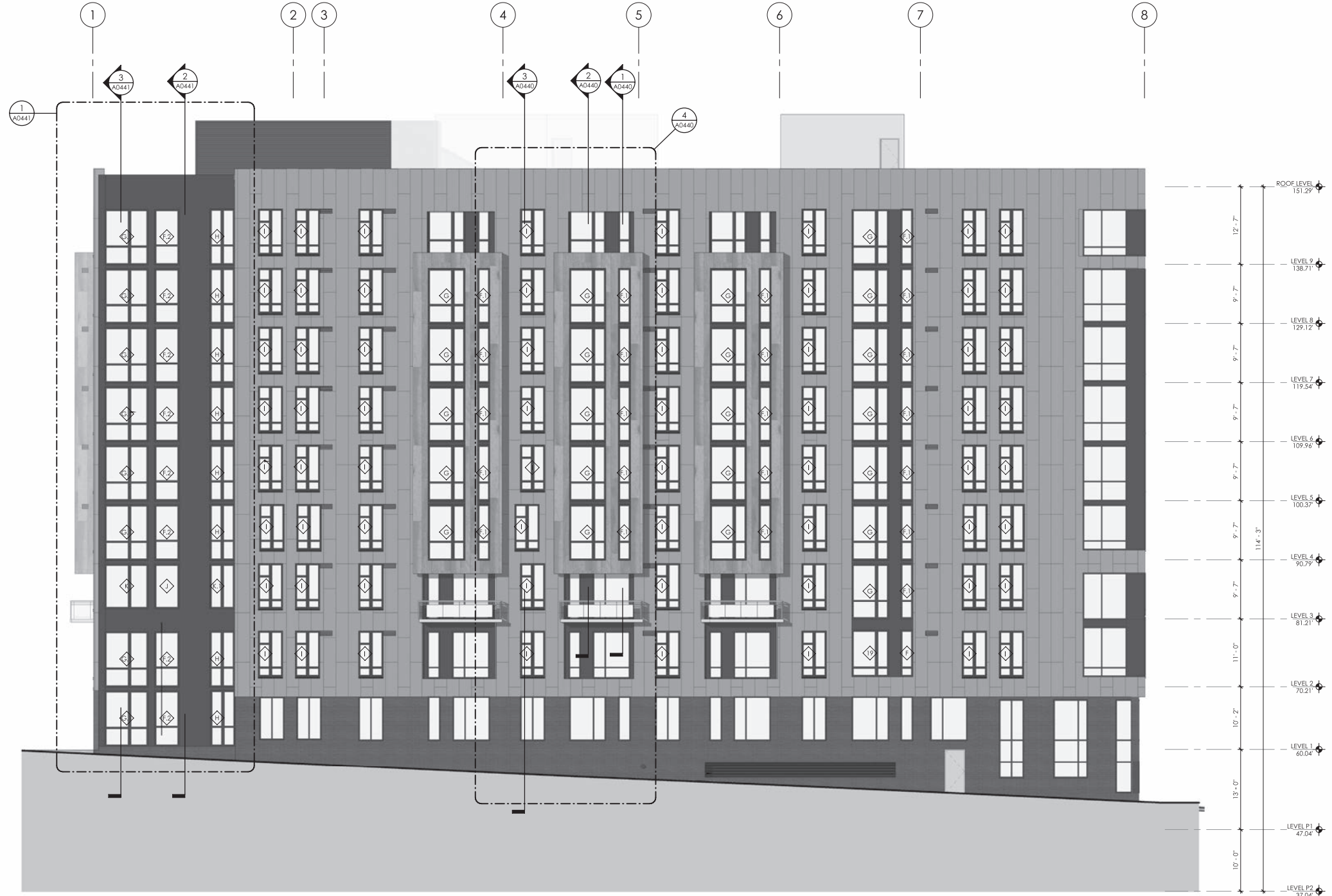
① WEST ELEVATION SCALE: 1/8" = 1'-0"

Field Verification Required | Sign Fabricator is responsible for: © Younts Design Inc.