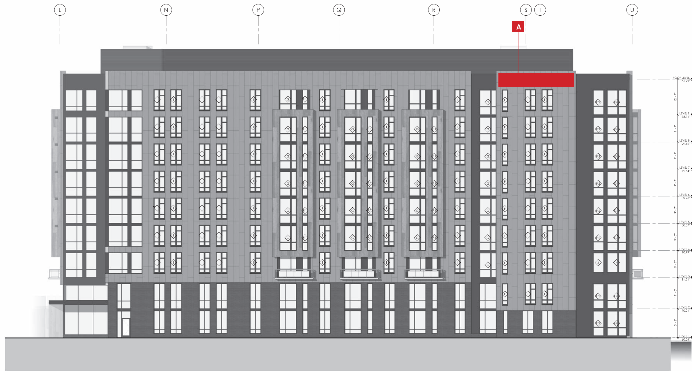
1 NORTH ELEVATION SCALE: 1/8" = 1'-0"