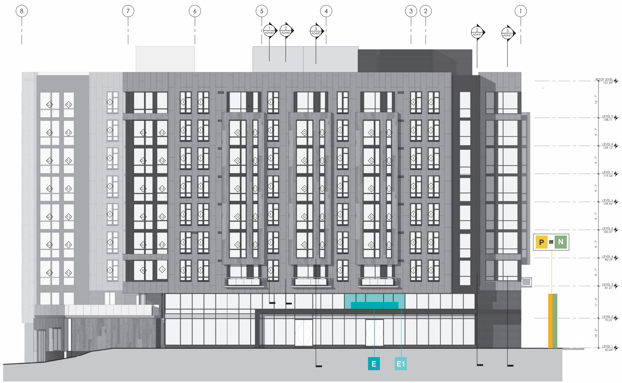
1 EAST ELEVATION SCALE: 1/8" = 1'-0"

Field Verification Required | Sign Fabricator is responsible for: © Younts Design Inc.