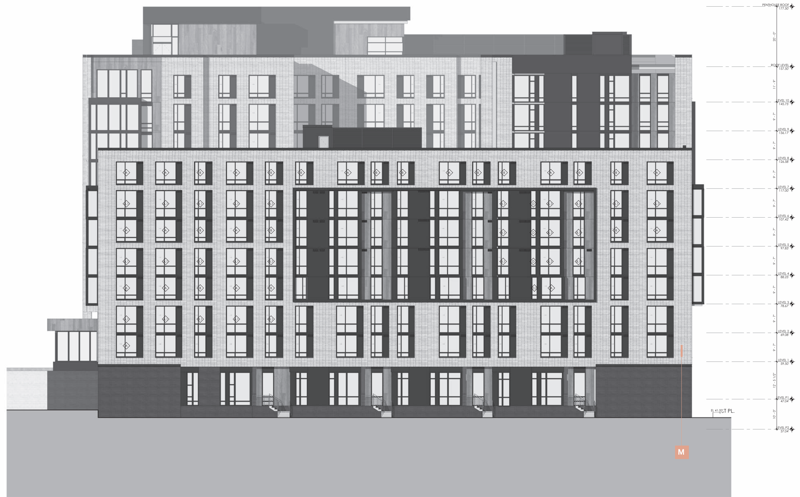
1 SOUTH ELEVATION SCALE: 1/8" = 1'-0"

Field Verification Required | Sign Fabricator is responsible for: © Younts Design Inc. Final design and engineering of components indicated including all aspects of mounting, fabrication, anchoring and attachment. Structural integrity, electrical function, and connections to power and communications sources as specified by the owner. Coordination with contractors in others trades, including but not limited to: mechanical, electrical, plumbing, fire, structural, and landscaping. Verification of conditions in field prior to submission of shop drawings and production of samples. Submittals for approval by Younts Design prior to fabrication and installation, including but not limited to shop drawings of all graphics with seal of registered engineer and samples of all materials, colors, applications and finishes.