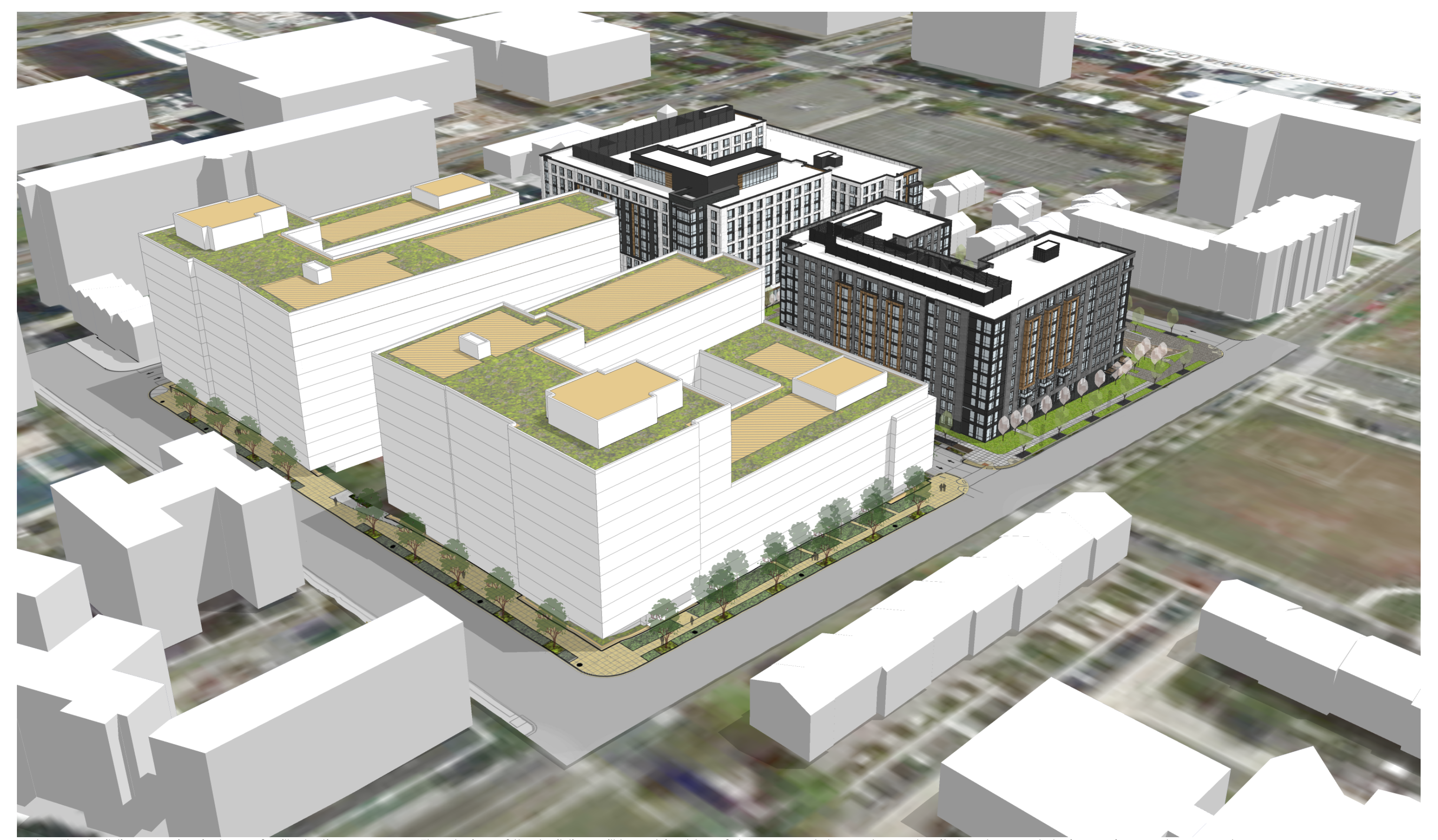
Note: The building massing is shown for illustrative purposes. The design of the building will be subject to a future second stage planned unit development design review and approval.