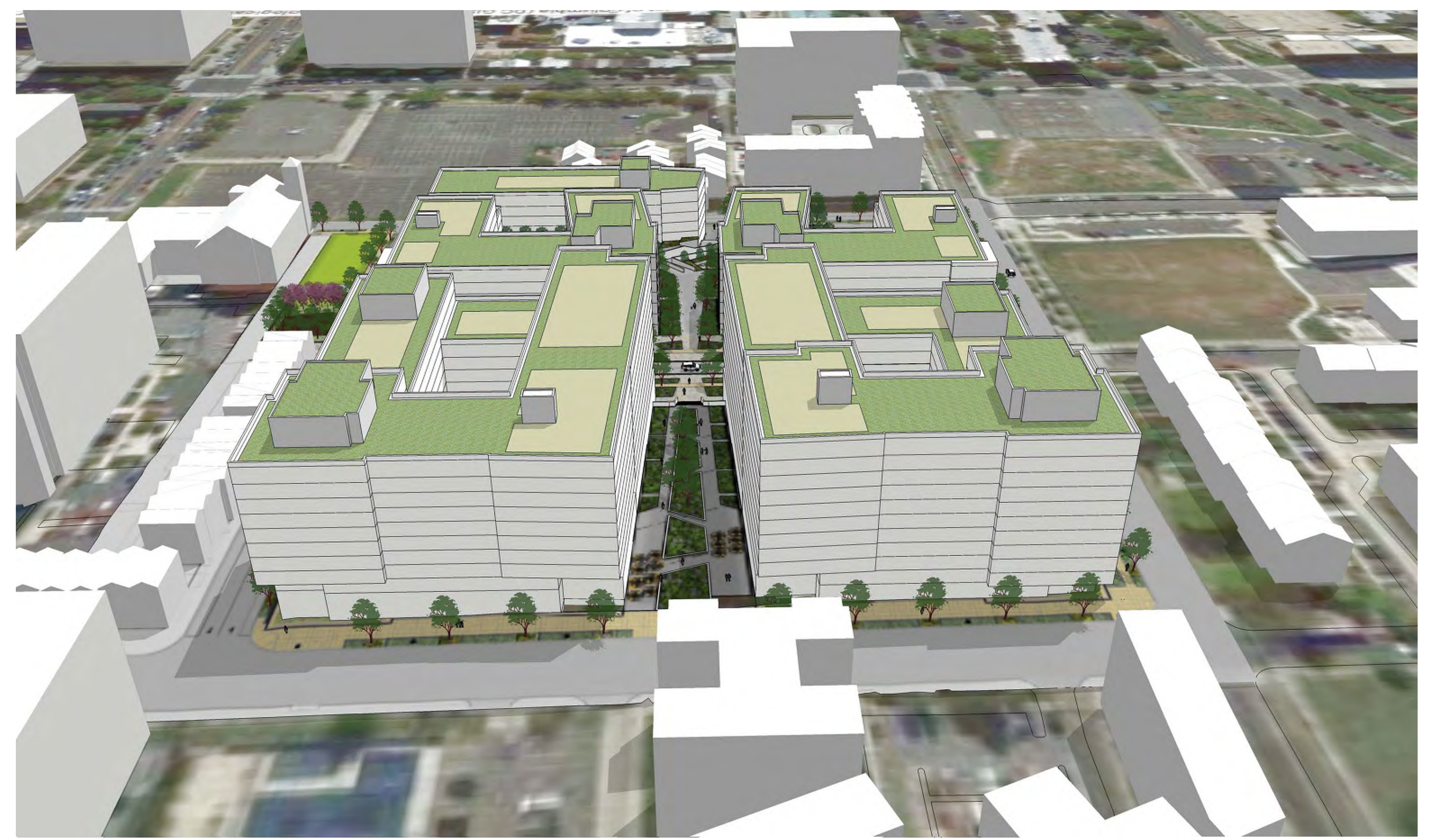
Note: The building massing is shown for illustrative purposes. The design of the buildings will be subject to a future second stage planned unit development design review and approval.

Aerial View from North (Approved Per ZC ORDER 15-20) A.37