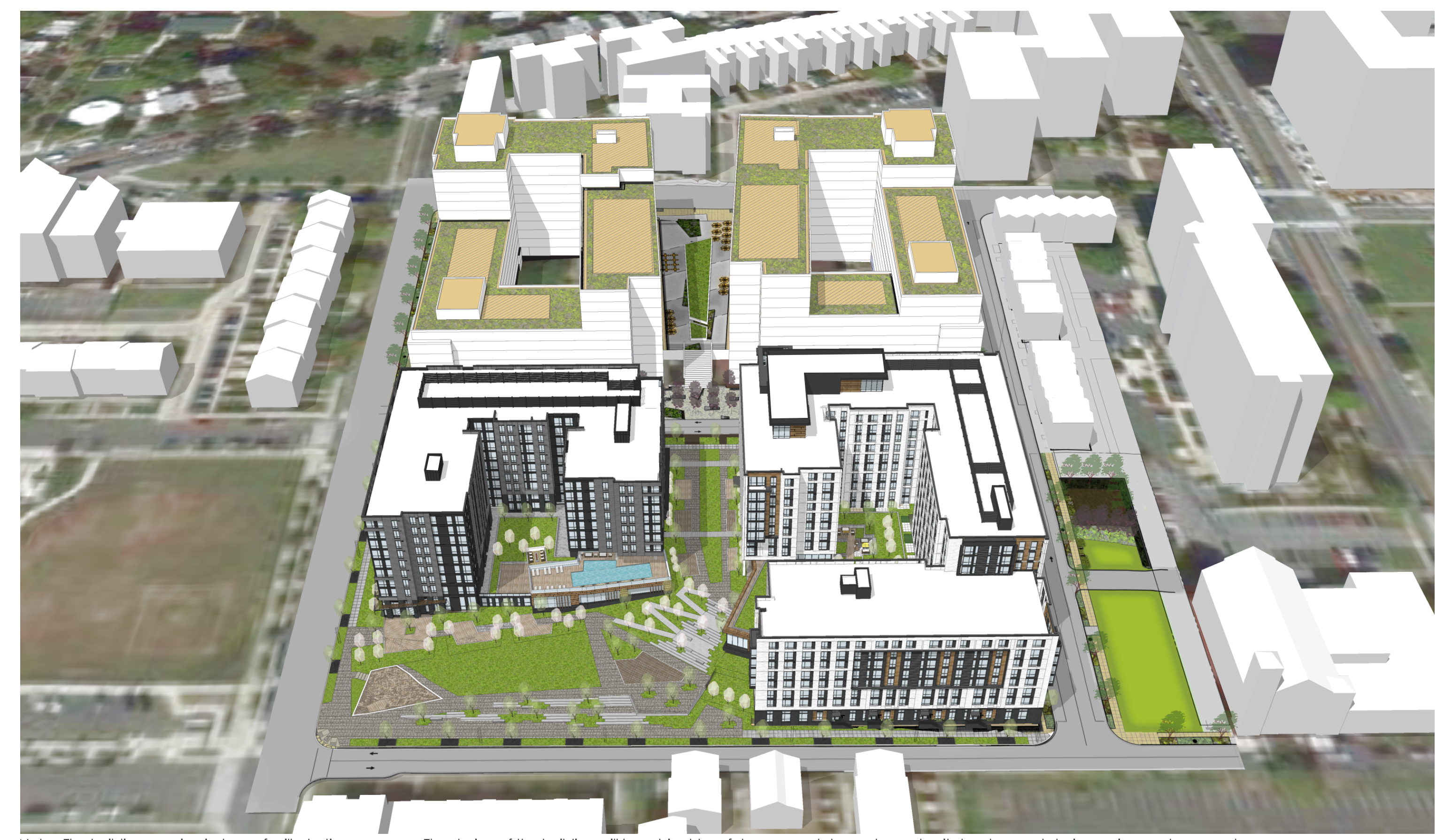
Note: The building massing is shown for illustrative purposes. The design of the building will be subject to a future second stage planned unit development design review and approval.

Proposed Modification - Aerial View from South