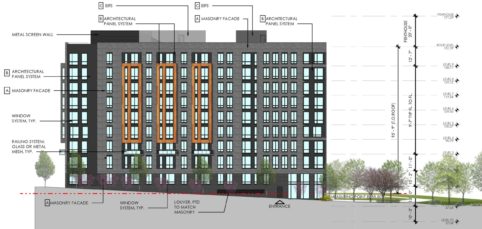
SOUTHWEST BUILDING - WEST ELEVATION