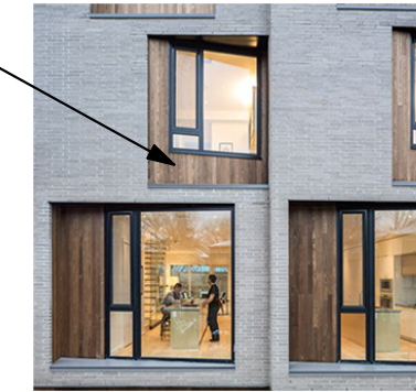
B ARCHITECTURAL PANEL SYSTEM