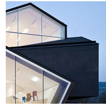
C EXTERIOR INSULATION FINISHING SYSTEM (EIFS)