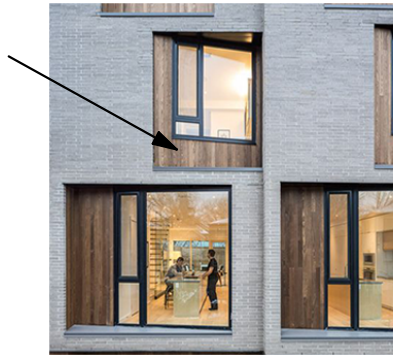
B ARCHITECTURAL PANEL SYSTEM