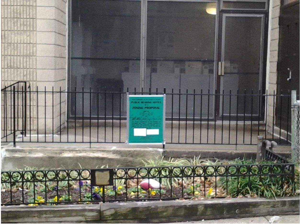
1. ZC 15-20 Posted 12-22-15 1st Terrace NW