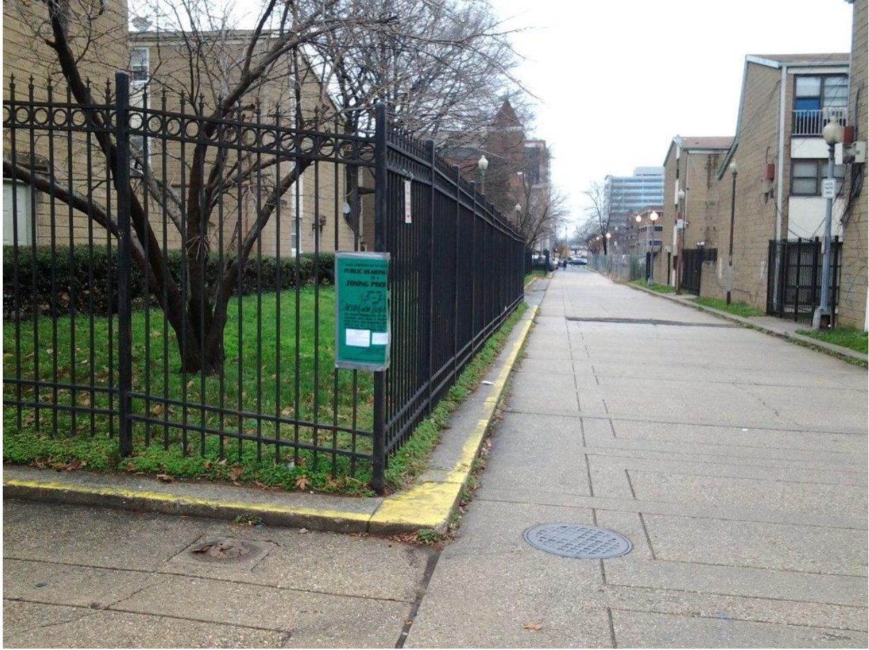
2. ZC 15-20 Posted 12-22-15 1st Terrace and L Street, NW