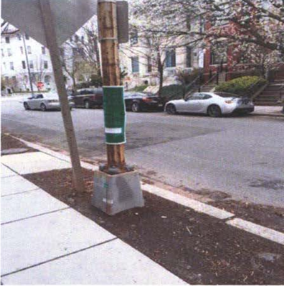
24. 2716 Ontario Rd (east side)