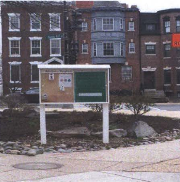
16. Lanier PL NW (south) and Adams Mill Rd NW