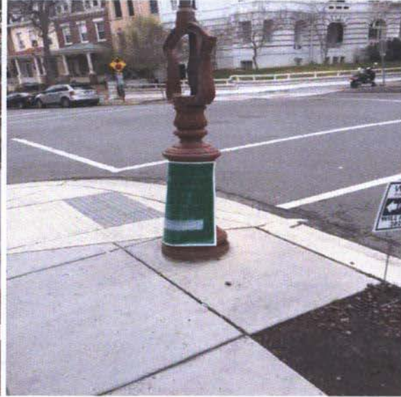
14. Ontario Rd NW (south) and Lanier PL NW