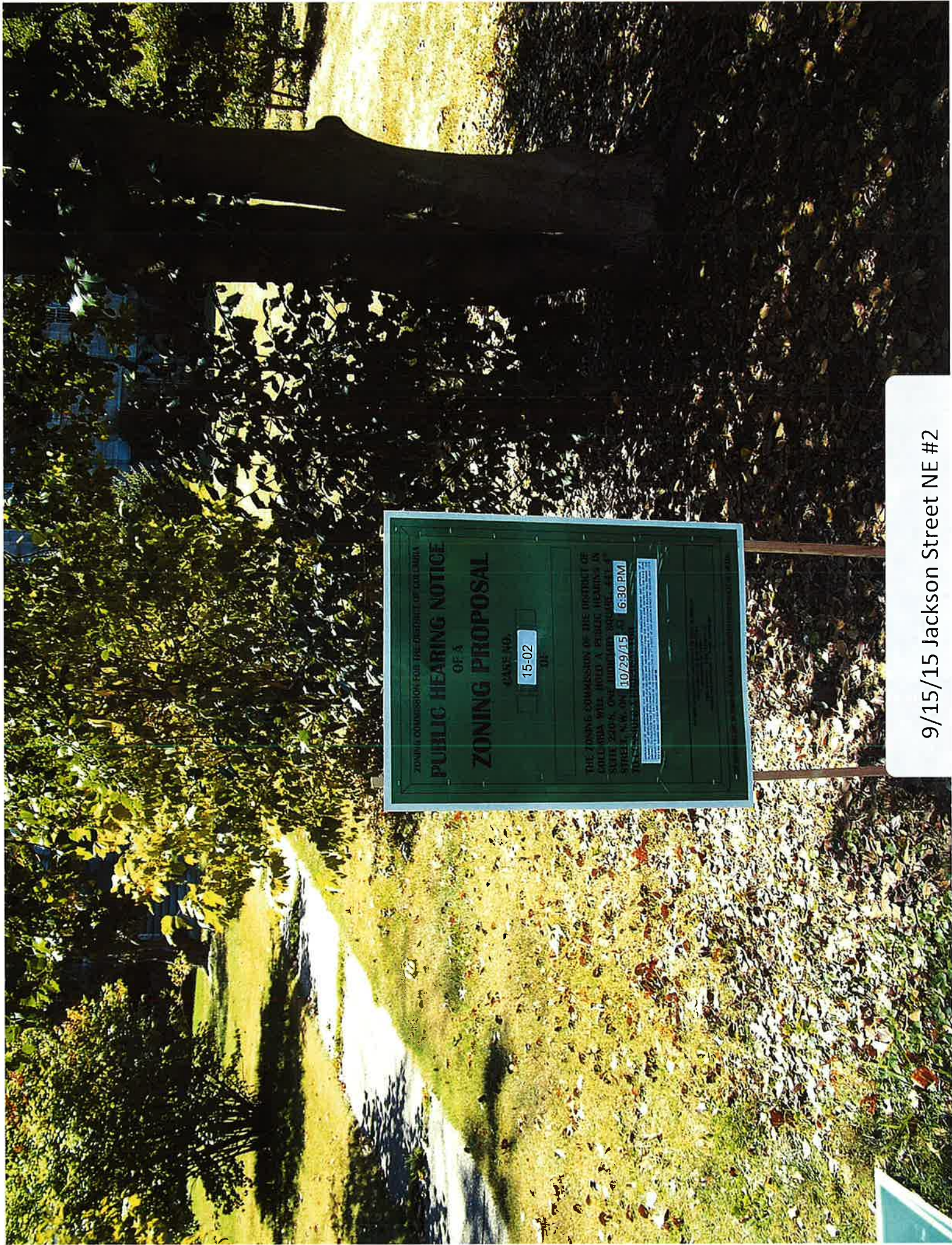
9/15/15 Jackson Street NE #2