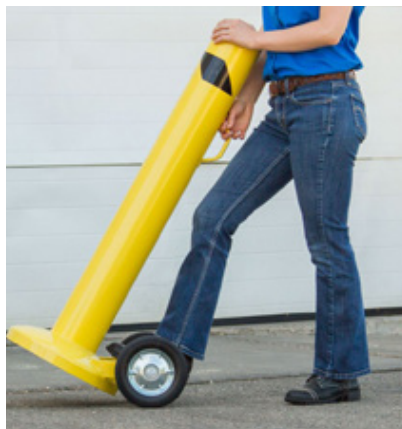
PORTABLE BARRIER ELEMENTS