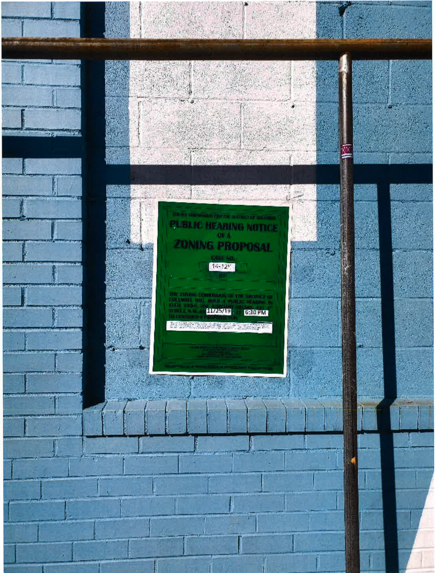
11/1/19 – 6th Street NE