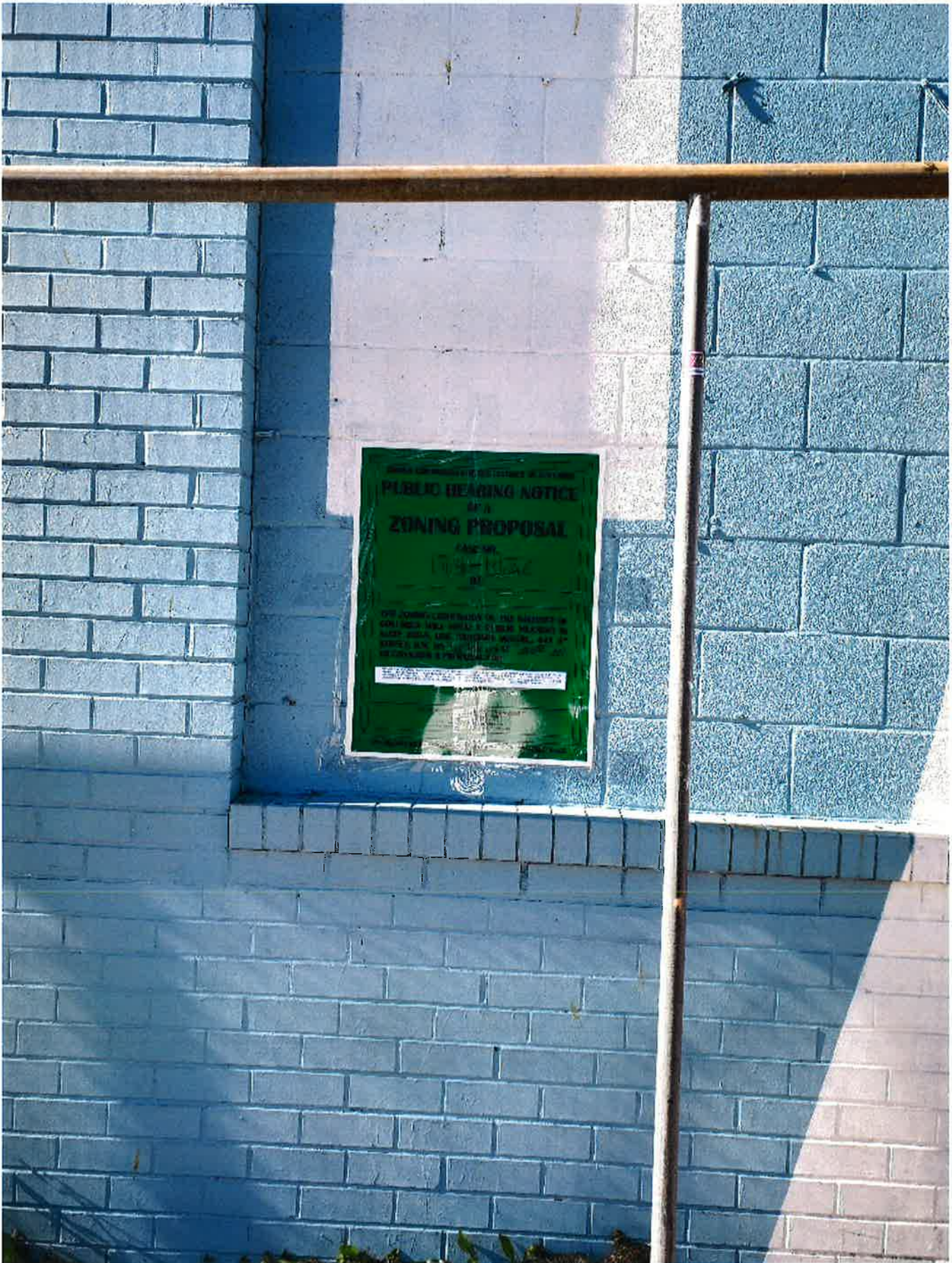
11/13/19 – 6 th Street NE