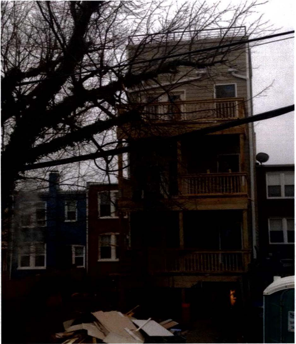
3015 Warder St. NW