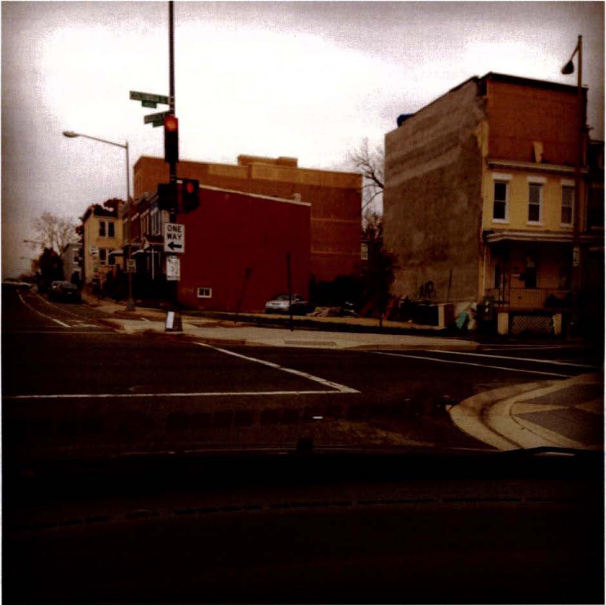
Columbia Road & Warder St. NW