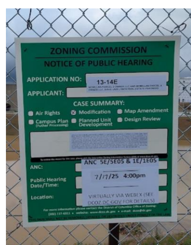
7/10/25 Michigan Ave NW