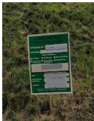
7/10/25 Channing St NW