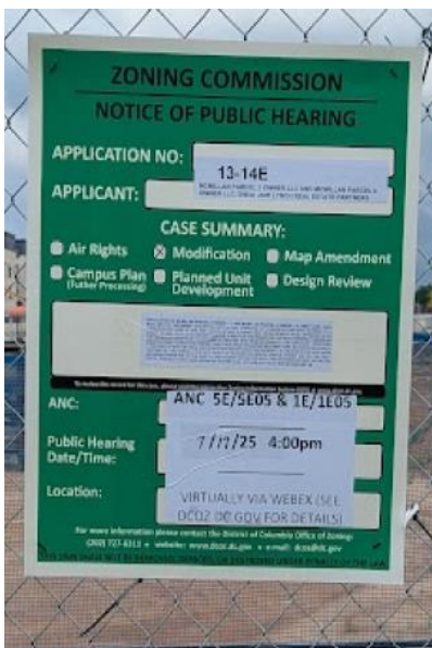
7/10/25 N. Capitol St NW