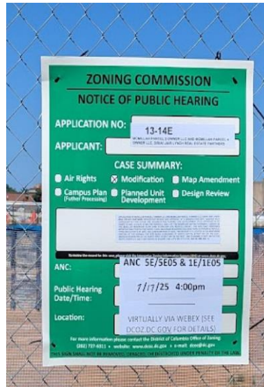
6/20/25 N. Capitol St NW