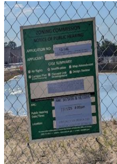
7/3/25 3 rd St NW