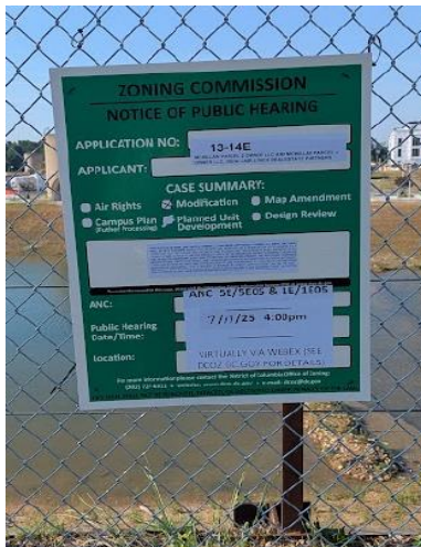
7/3/25 Michigan Ave NW