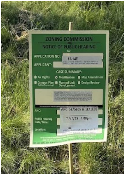
6/12/26 Channing St NW