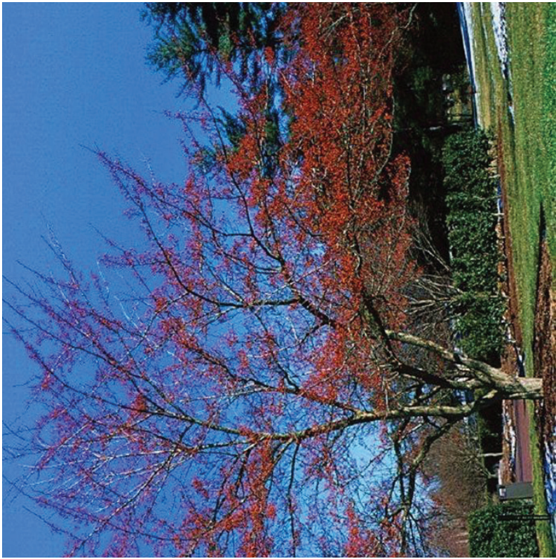
Crataegus viridis 'Winter King'