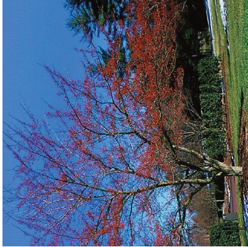
Crataegus viridis 'Winter King'