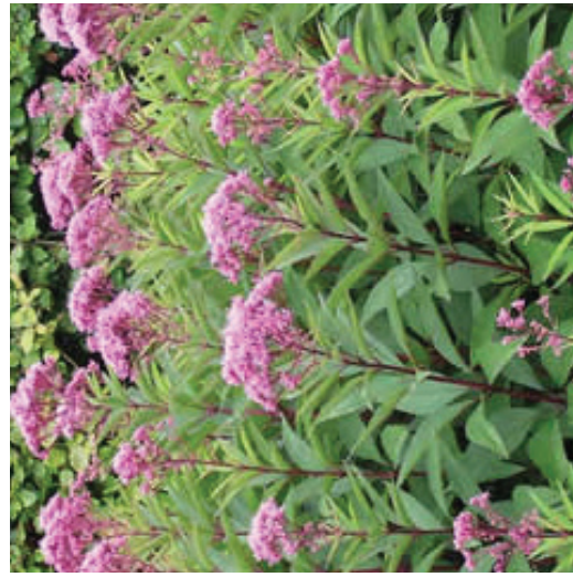
Eupatorium 'Little Joe'