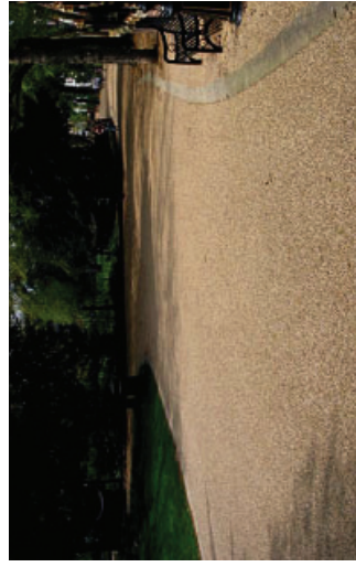
Olmsted Walk - pervious pavement with recycled concrete