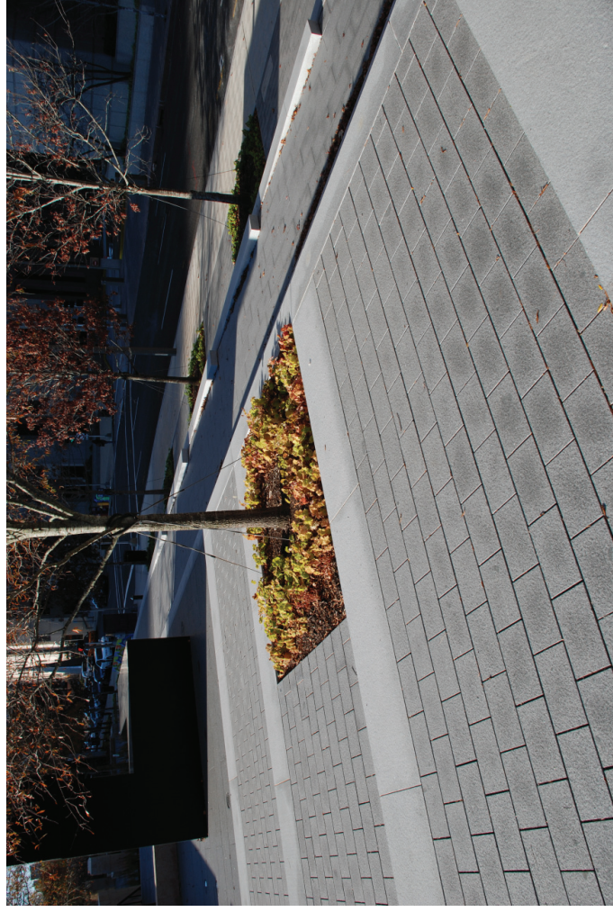
Paving - stone pavers with varied textures and sizes