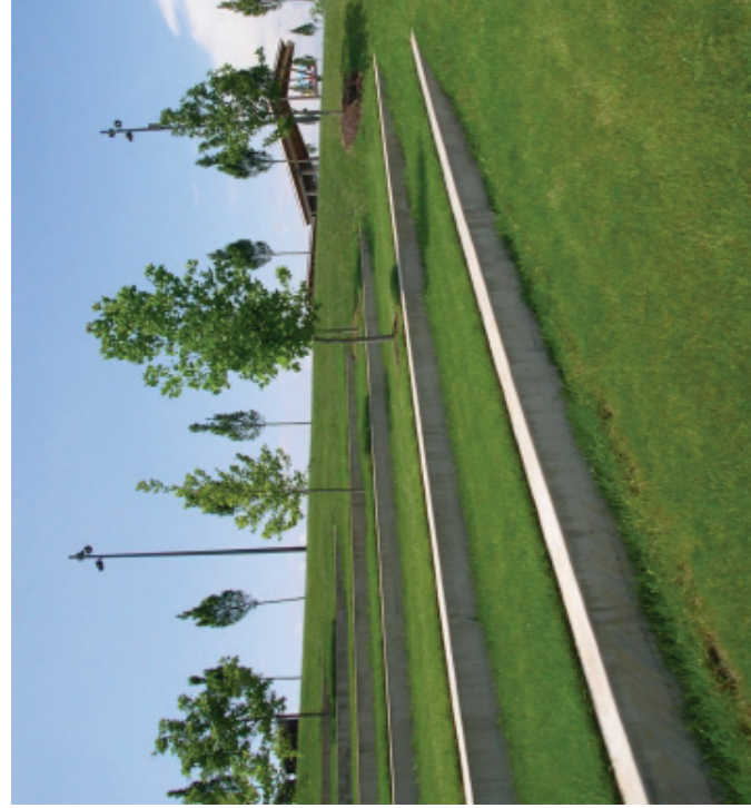
Amphitheater seating using recycled columns