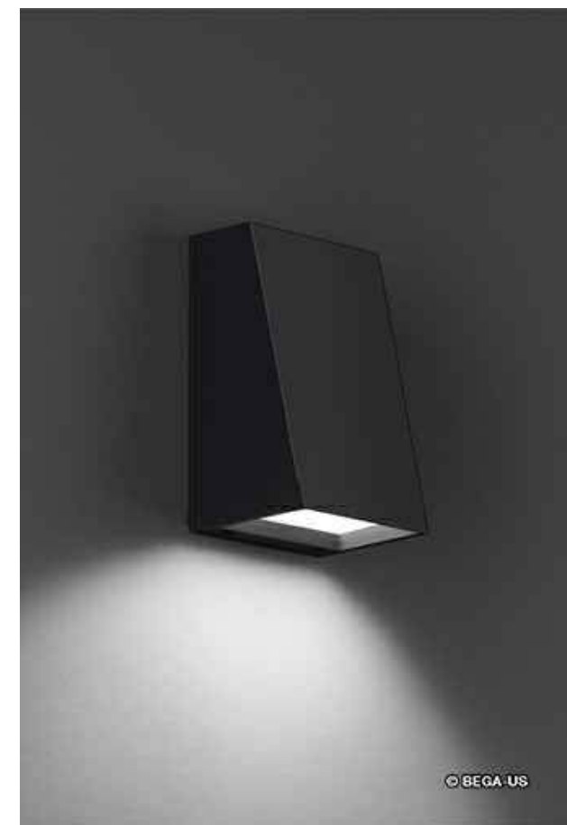
Surface wall with shielded light source Model # 3574 Manufacturer: Bega Bega Lighting Ph 805.684.0533 [VA Sales Ph]: (410) 712-0239 http://www.bega-us.com/