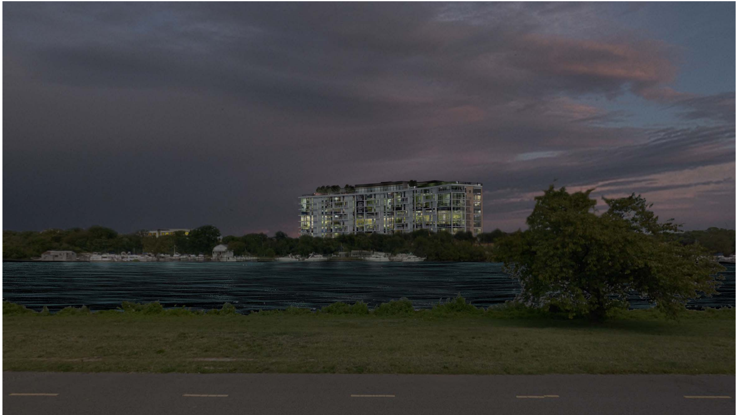
VIEW ACROSS ANACOSTIA RIVER