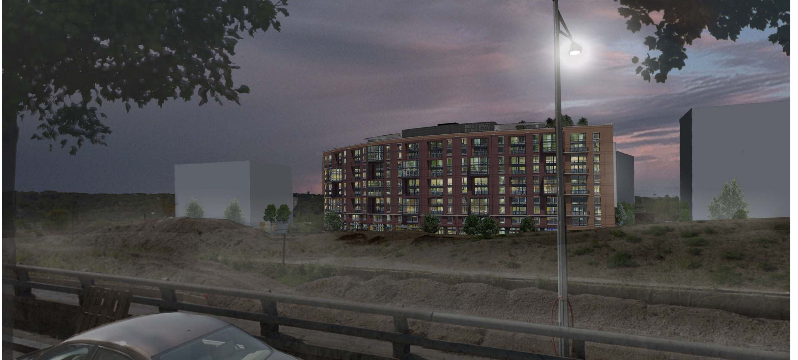
L STREET VIEW SOUTH