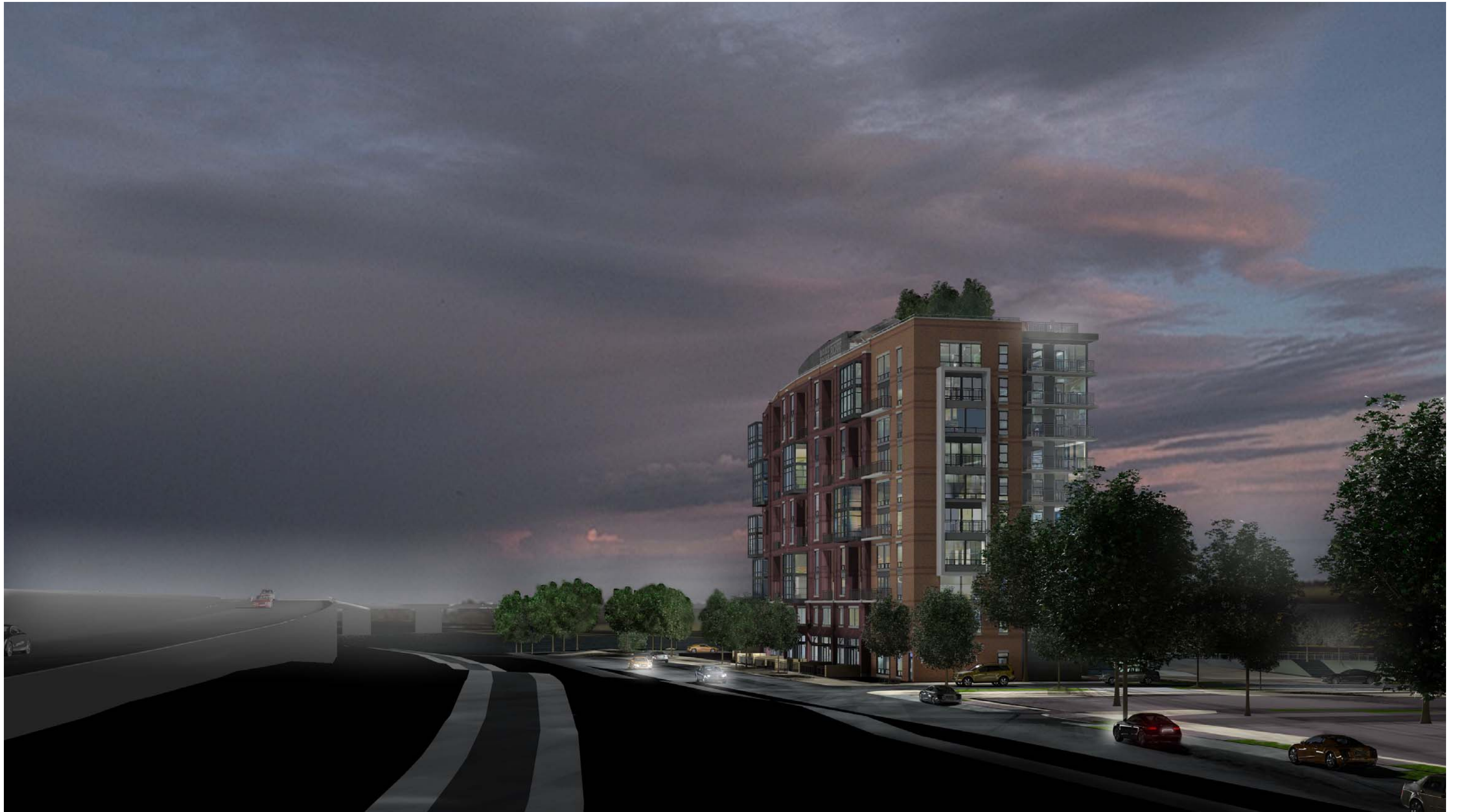
M STREET VIEW EAST