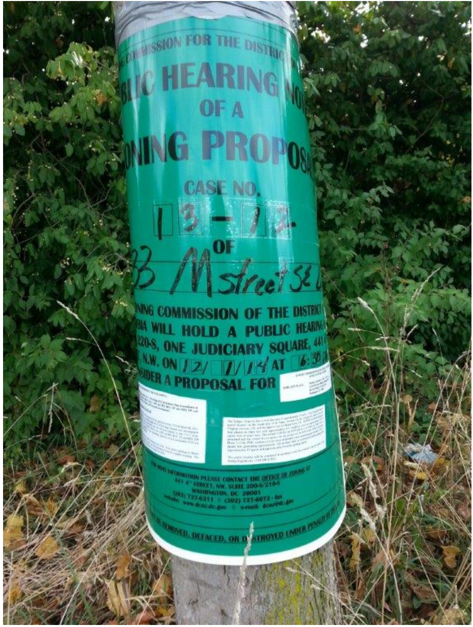
#2 ZC 13-12 Re-posted 10-24-14 Water Street SE