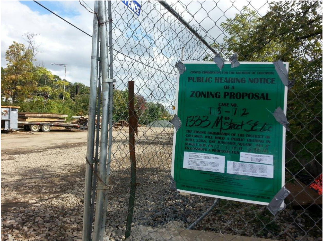
#3 s ZC 13-12 Re-Posted on 10-24-14 1333 M Street SE