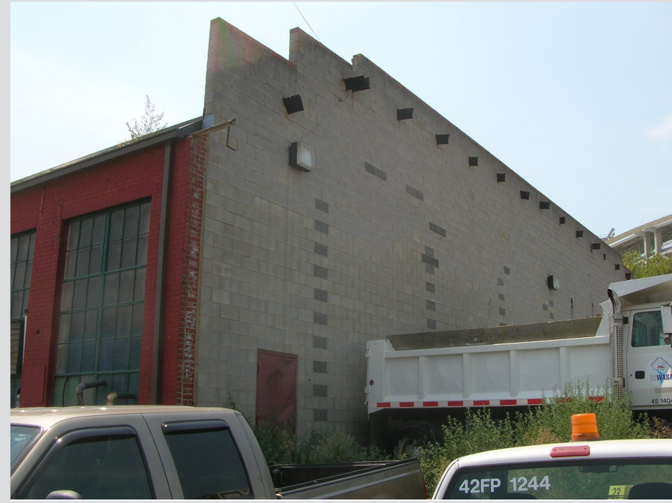
2 WELDING SHOP - NORTH ELEVATION