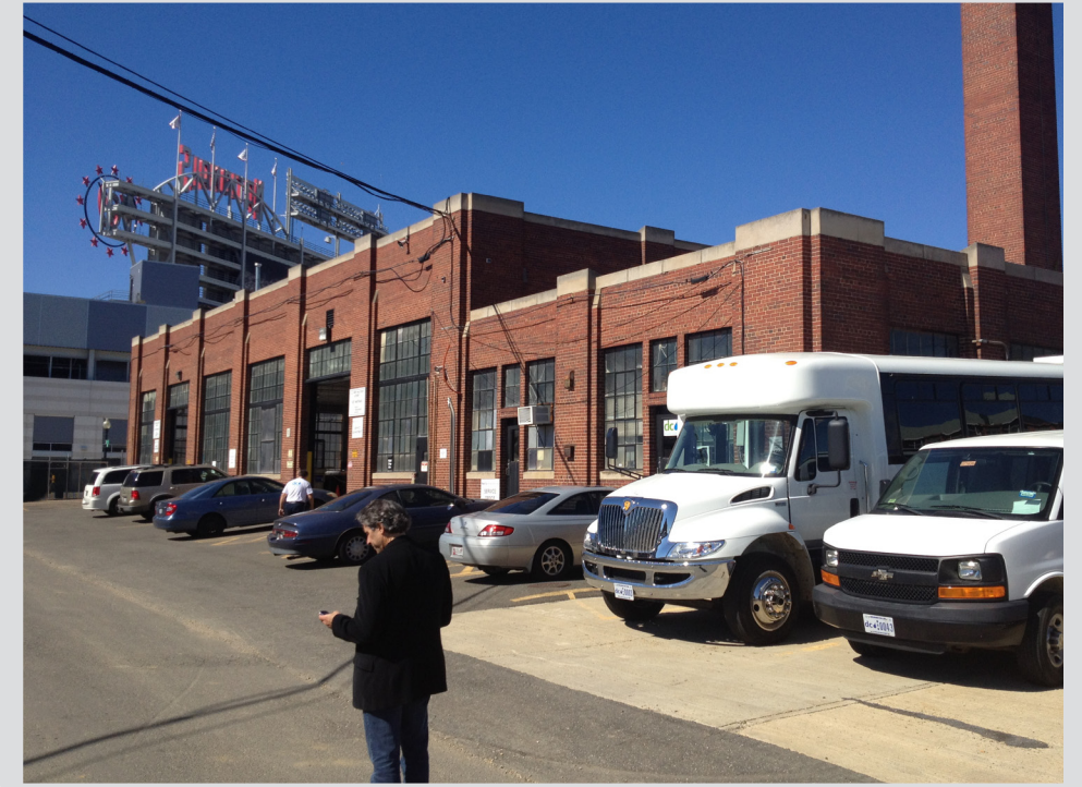
3 FLEET MAINTENANCE SHOP - SOUTH ELEVATION