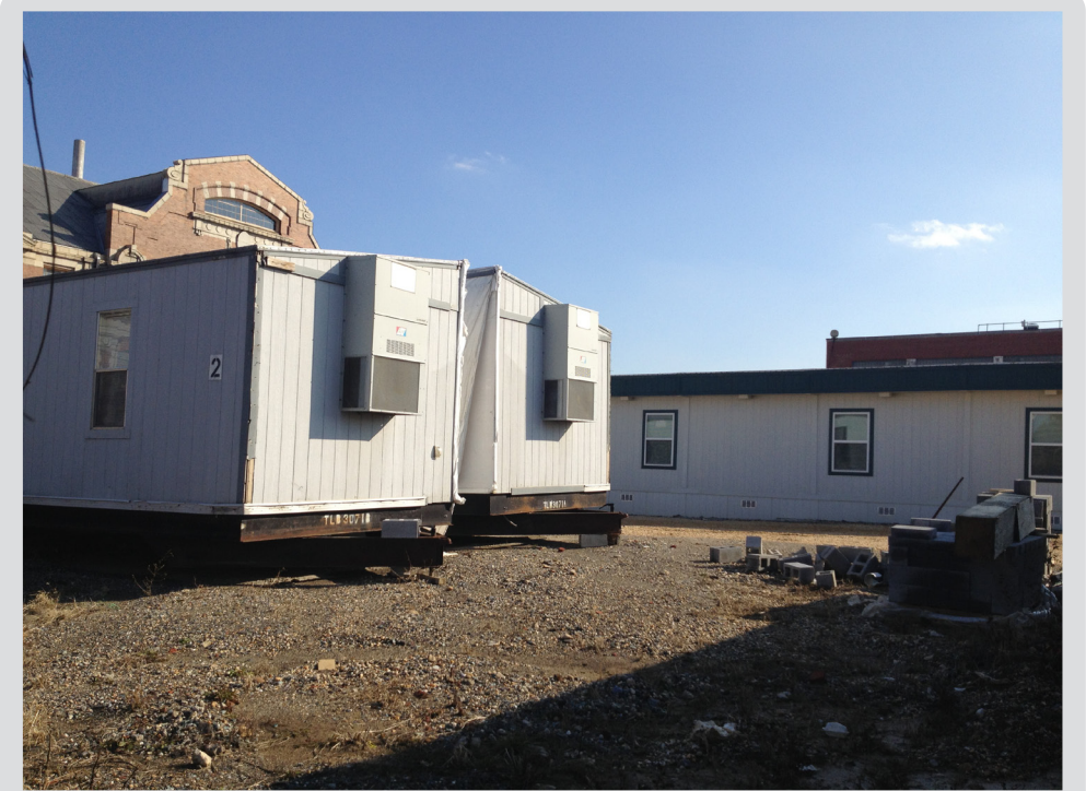
6 TEMPORARY OFFICE TRAILERS - WEST ELEVATION