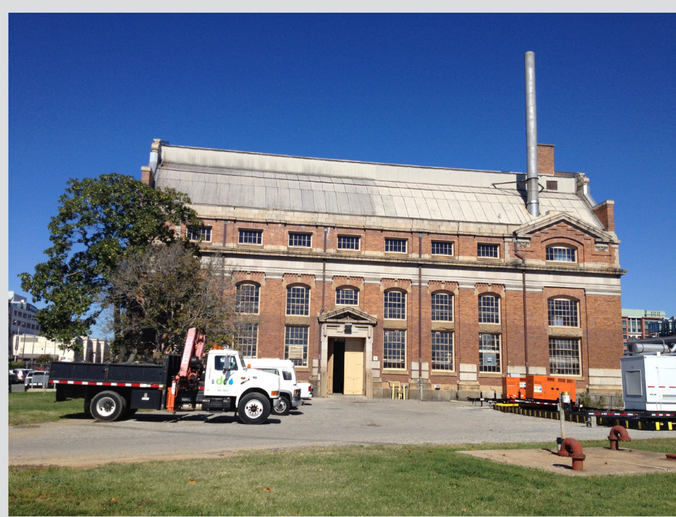
3 MAIN PUMP STATION - SOUTH ELEVATION