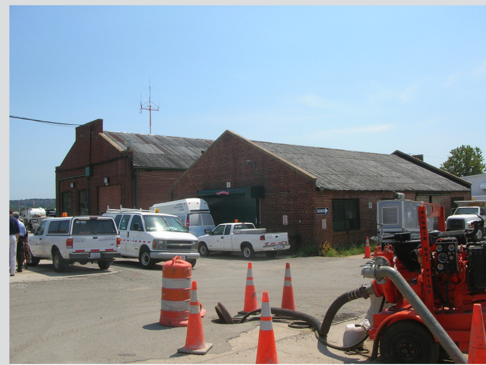
5 CONCRETE PREFAB & CARPENTER SHOP - NORTH ELEVATION