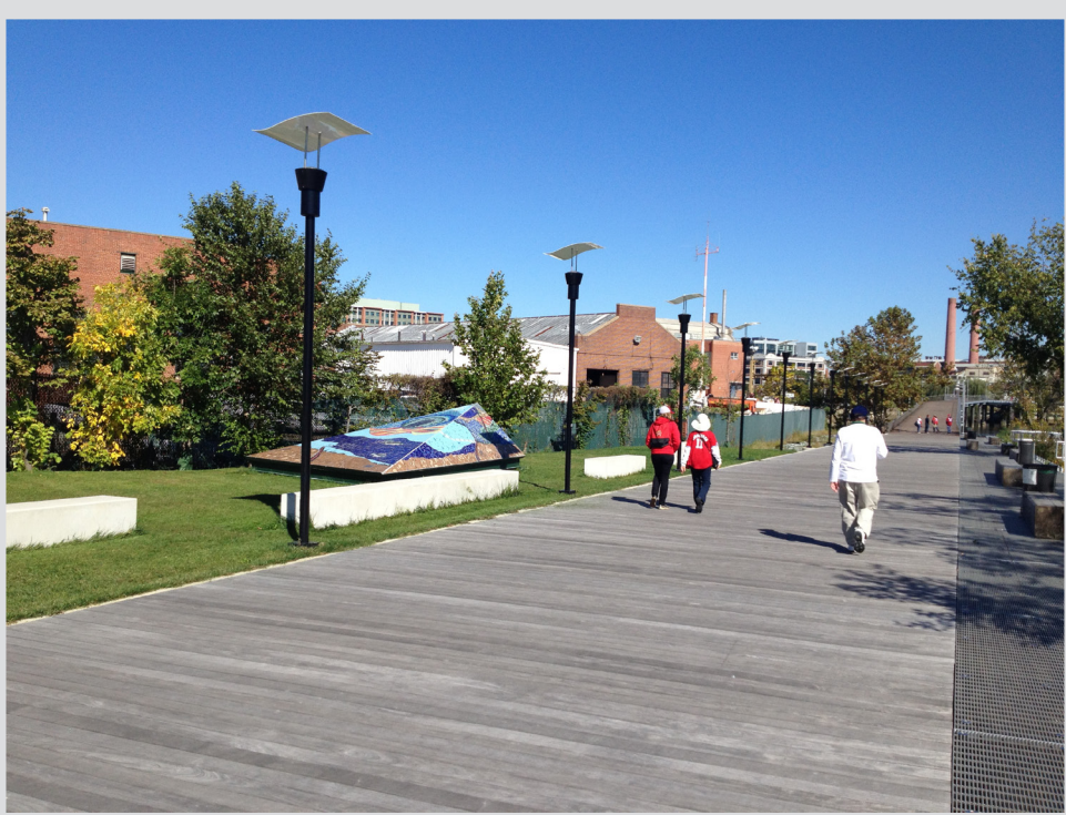
1 DIAMOND TEAGUE PARK & ANACOSTIA RIVERWALK TRAIL