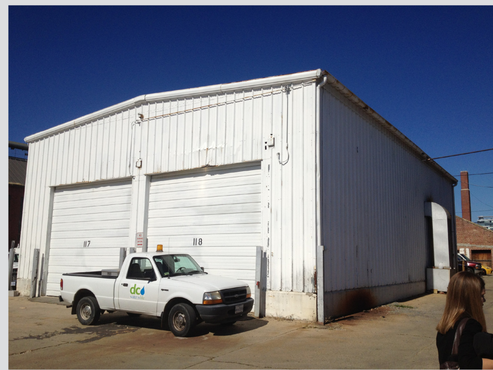
4 PAINT SHOP - SOUTH ELEVATION