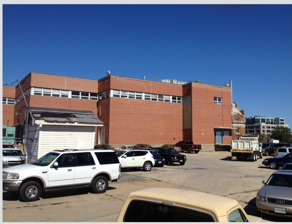
4 OST PUMP STATION - SOUTH ELEVATION