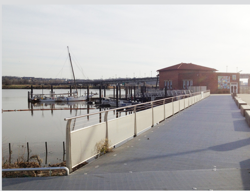
2 EARTH CONSERVATION CORPS