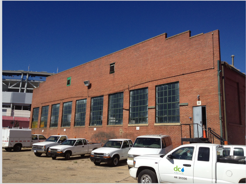
1 WELDING SHOP - SOUTH ELEVATION