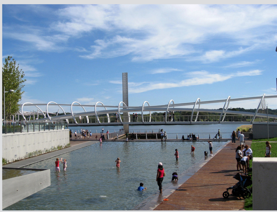
6 THE YARDS PARK