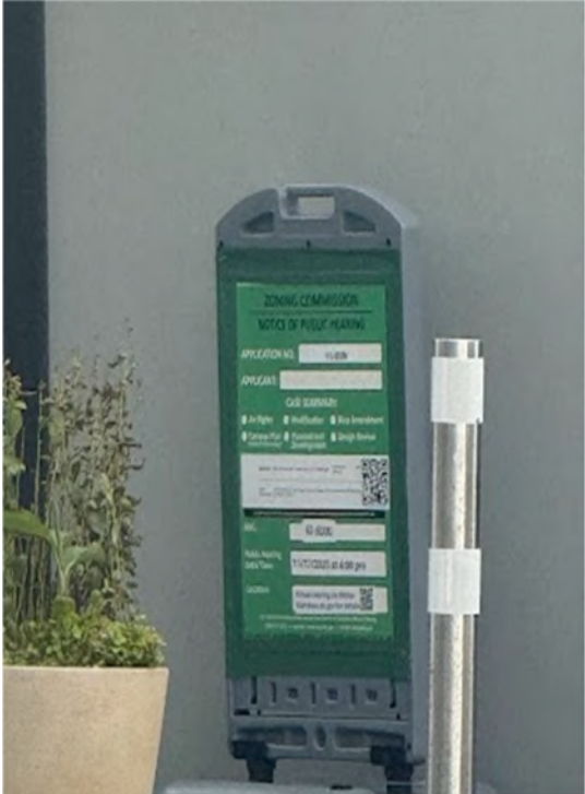
10/21/25 Wharf St SW