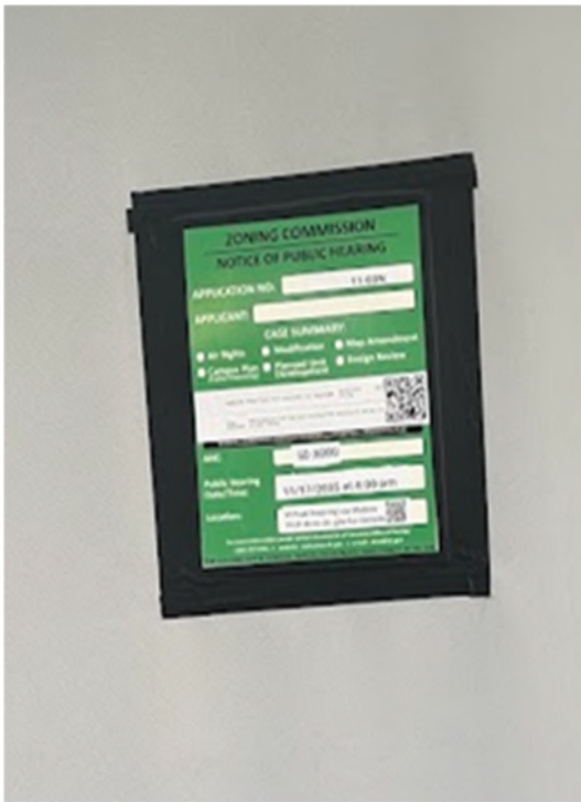
10/14/25 Wharf St SW