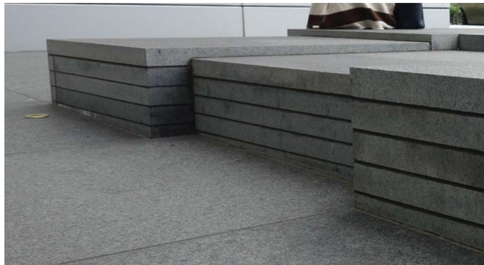
Granite Retaining Wall