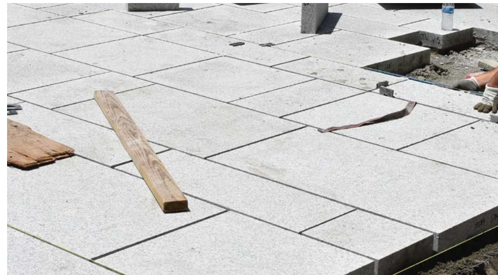
Light Gray Granite Paving (Mt. Airy granite, Phase 1 CYC Plaza)