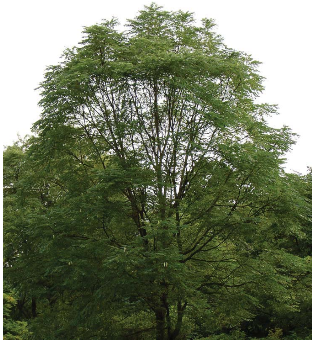
Kentucky Coffee Tree ( Gymnocladus dioicus )