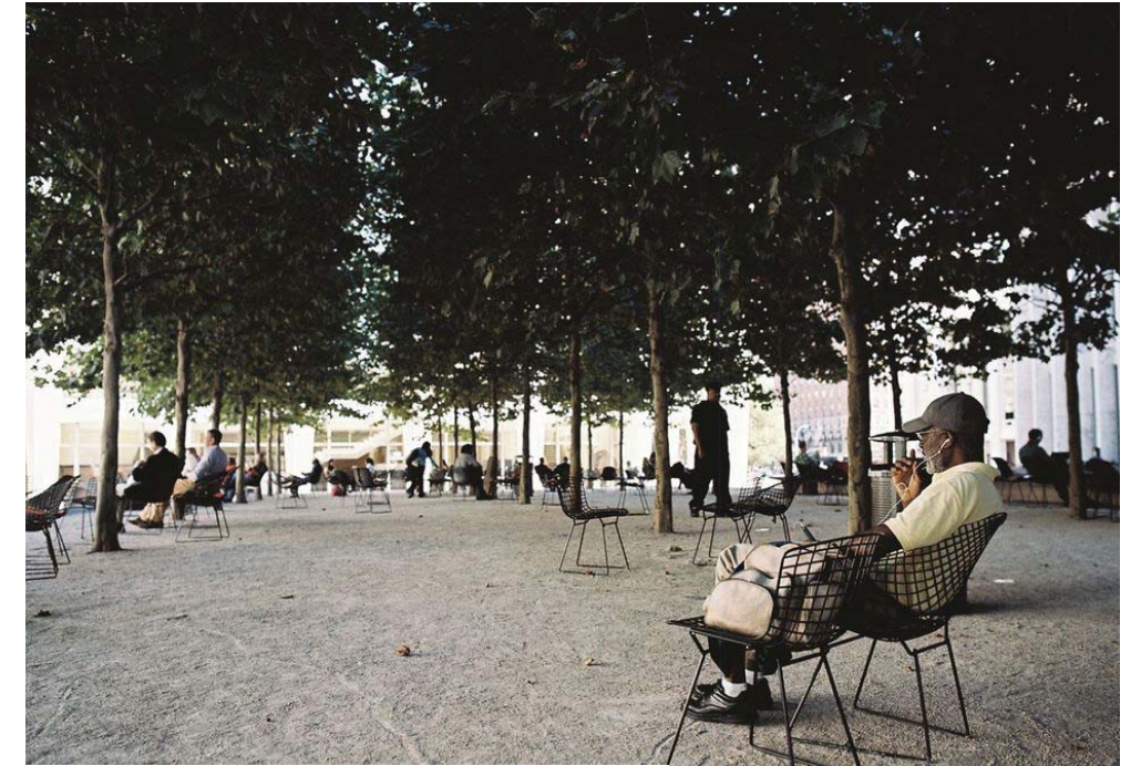
Crushed Stone Paving on Raised Terrace