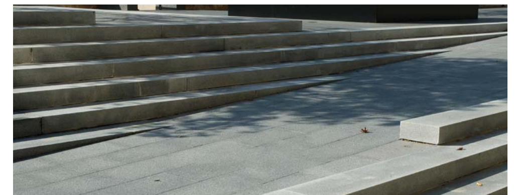
Stair / Ramp at Hotel Lobby