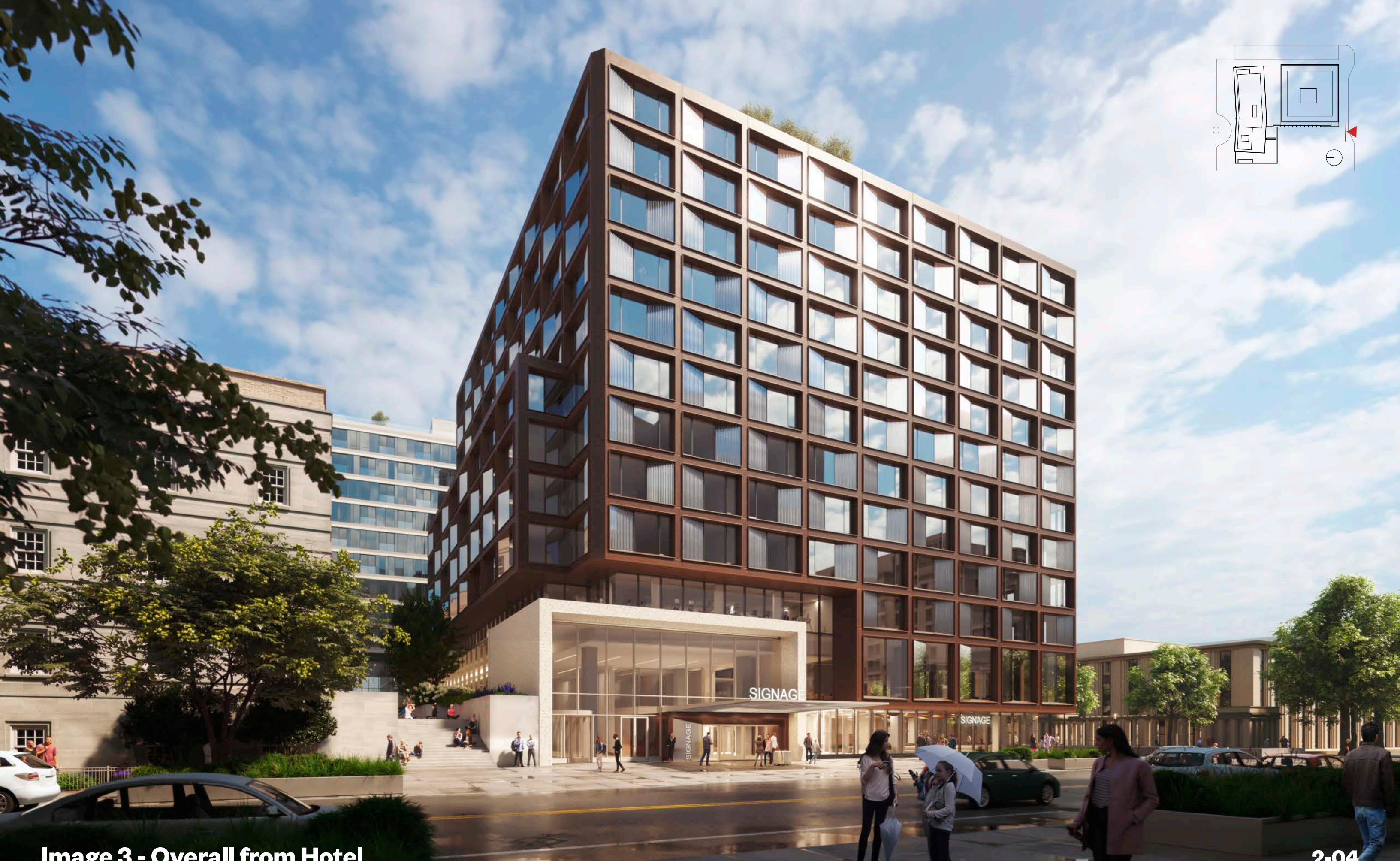
Image 3 - Overall from Hotel

PUD Stage II Filing: Capitol Crossing III LLC and Capitol Crossing IV LLC: Square 566, Lots 861-862 (part of Record Lot 50)