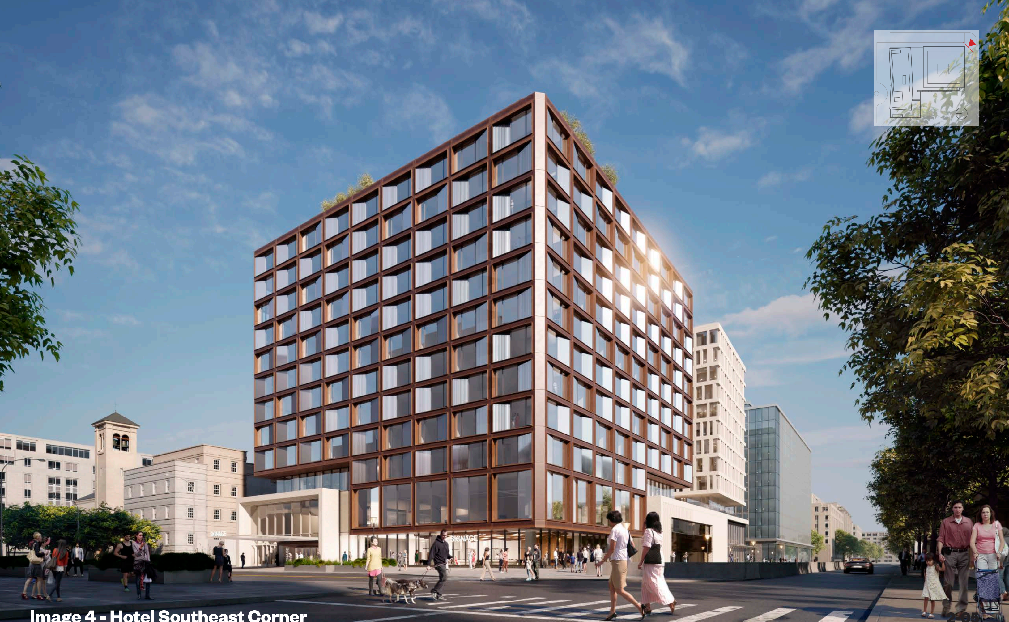
Image 4 - Hotel Southeast Corner

PUD Stage II Filing: Capitol Crossing III LLC and Capitol Crossing IV LLC: Square 566, Lots 861-862 (part of Record Lot 50)