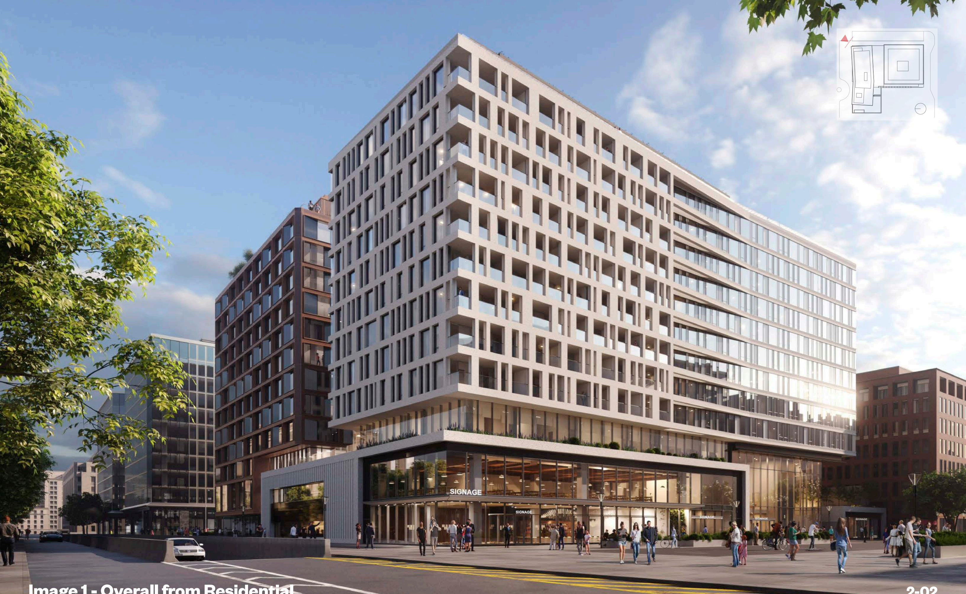
Image 1 - Overall from Residential

PUD Stage II Filing: Capitol Crossing III LLC and Capitol Crossing IV LLC: Square 566, Lots 861-862 (part of Record Lot 50)