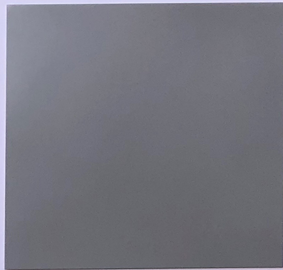
COMPOSITE METAL PANEL