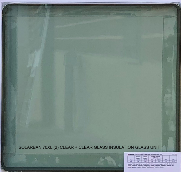
SOLARBAN 70XL (2) CLEAR + CLEAR GLASS INSULATION GLASS UNIT