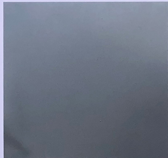
COMPOSITE METAL PANEL

PUD APPLICATION STAGE II - BLDG #4 SUPPLEMENTAL PRE-HEARING SUBMISSION TITLE: MATERIAL PALLETTE