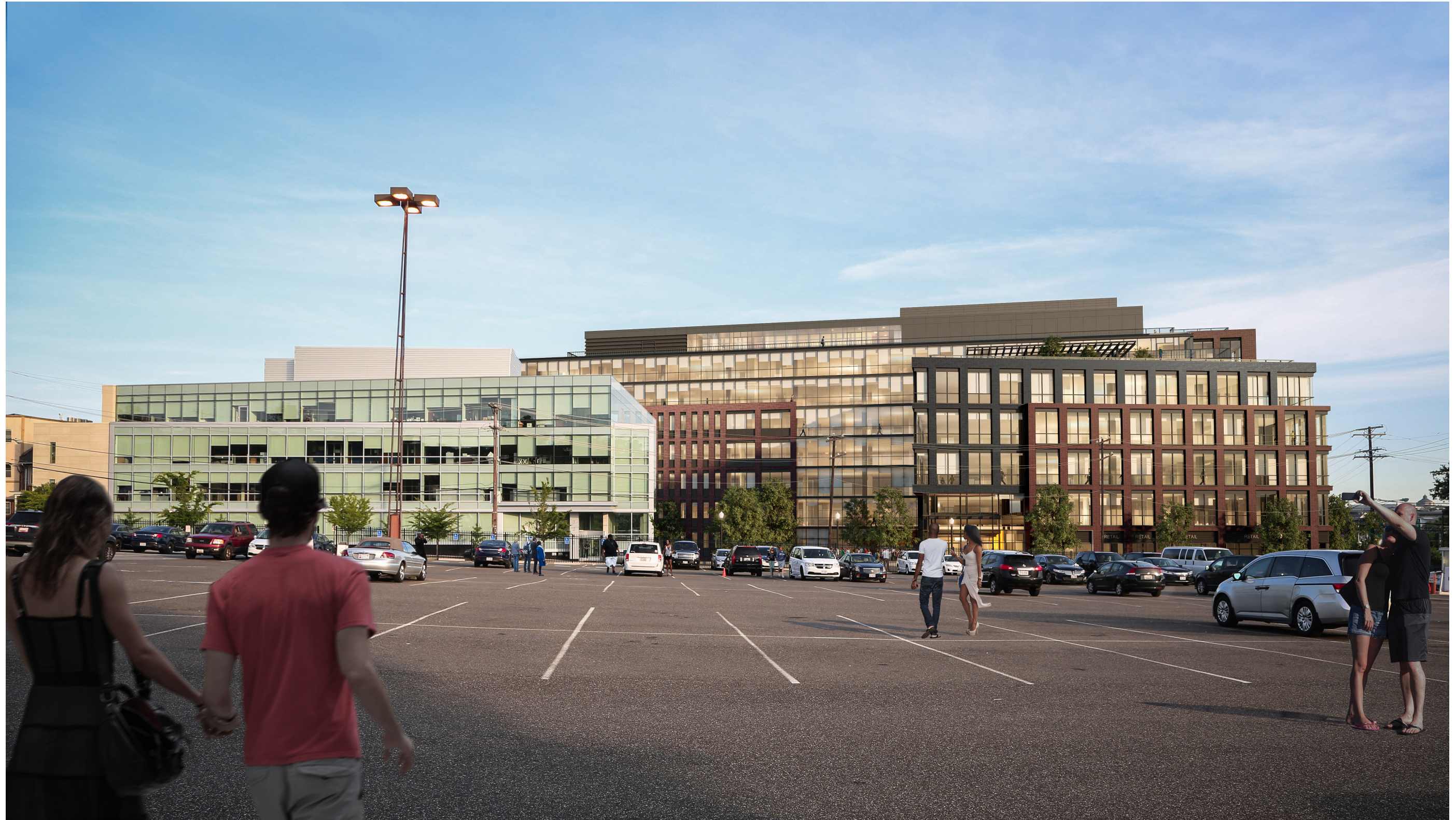
PERSPECTIVE: LOOKING WEST FROM EXISTING PARKING LOT