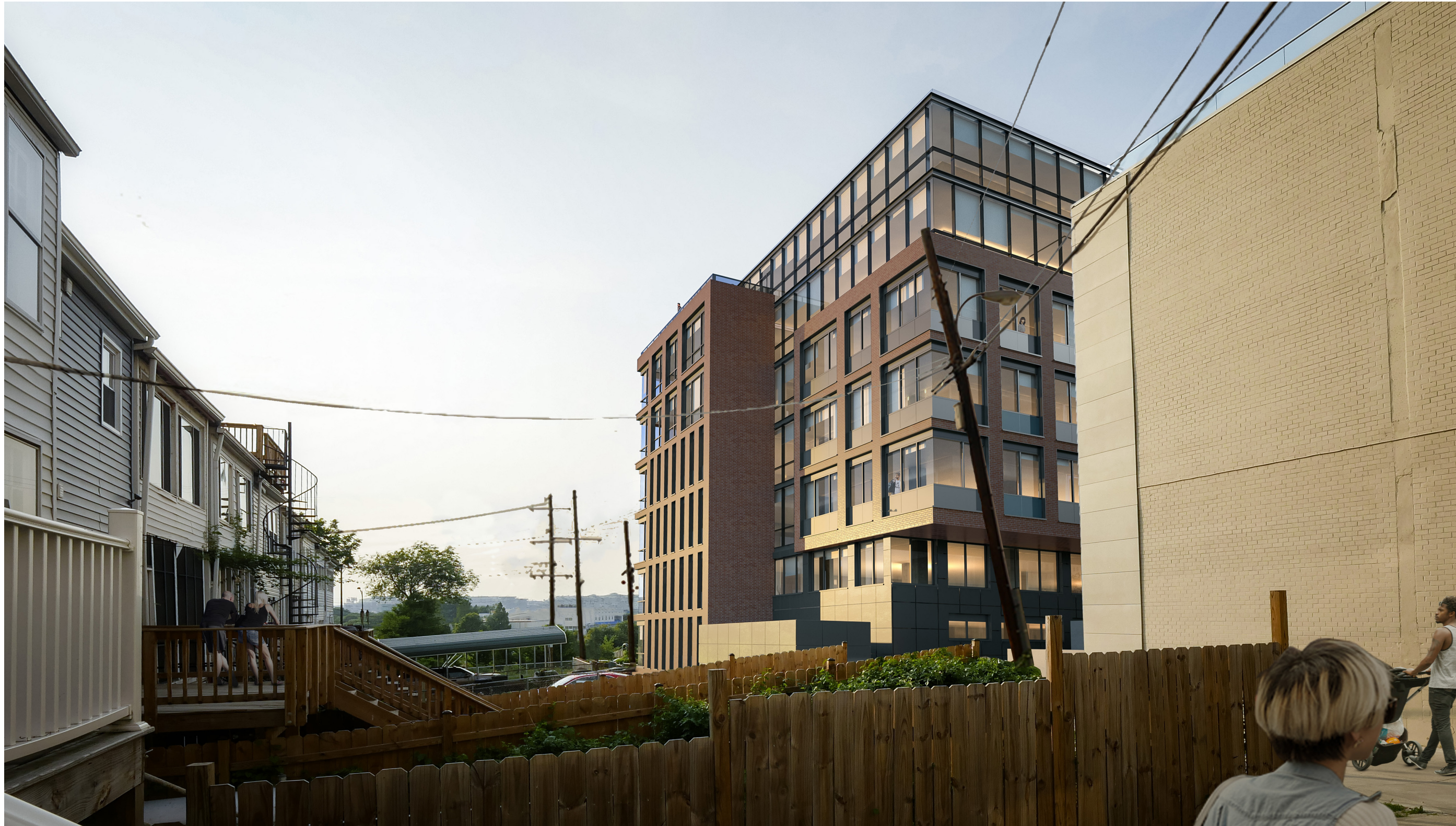
PERSPECTIVE: LOOKING WEST FROM CHICAGO STREET ROW HOUSES