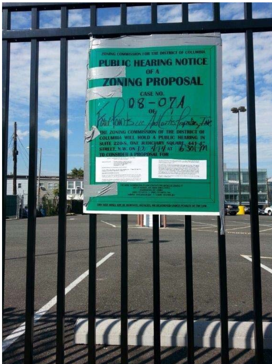
2. ZC 08-07A Reposted on 11-3-14 at 11:21 am 2255 Martin Luther King Ave SE