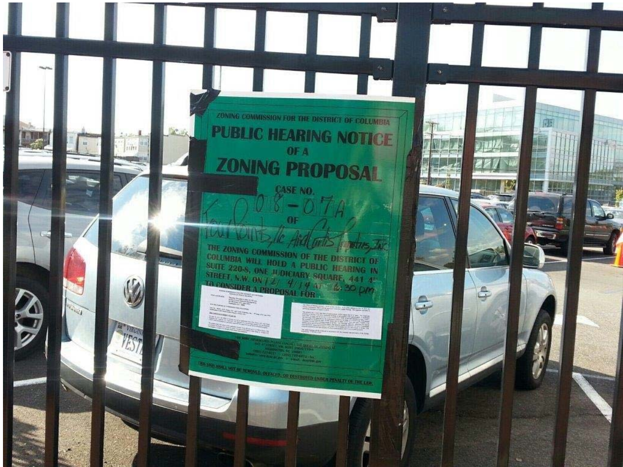
3. ZC 08-07A Re-posted 12-1-14 at 12:20 pm 2255 Martin Luther King Ave SE