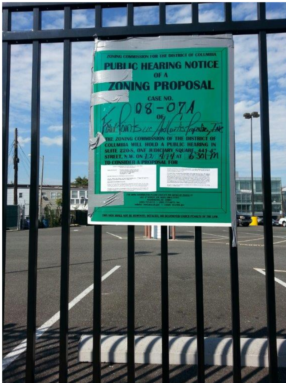
#1 ZC 08-07A 2255 Martin Luther King Ave., SE Posted 10-21-14 at 10:15 am