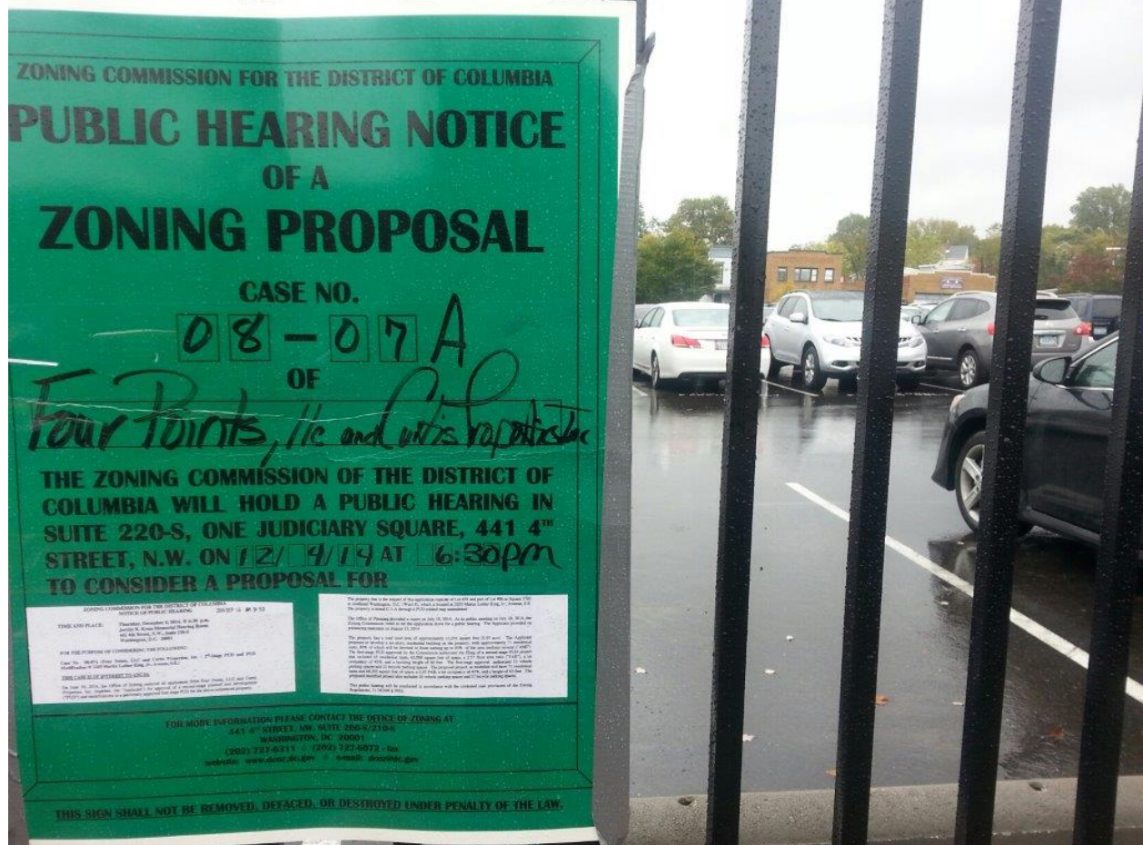
#6 ZC 08-07A Shannon Place, SE Posted 10-21-14. At 12:45 pm