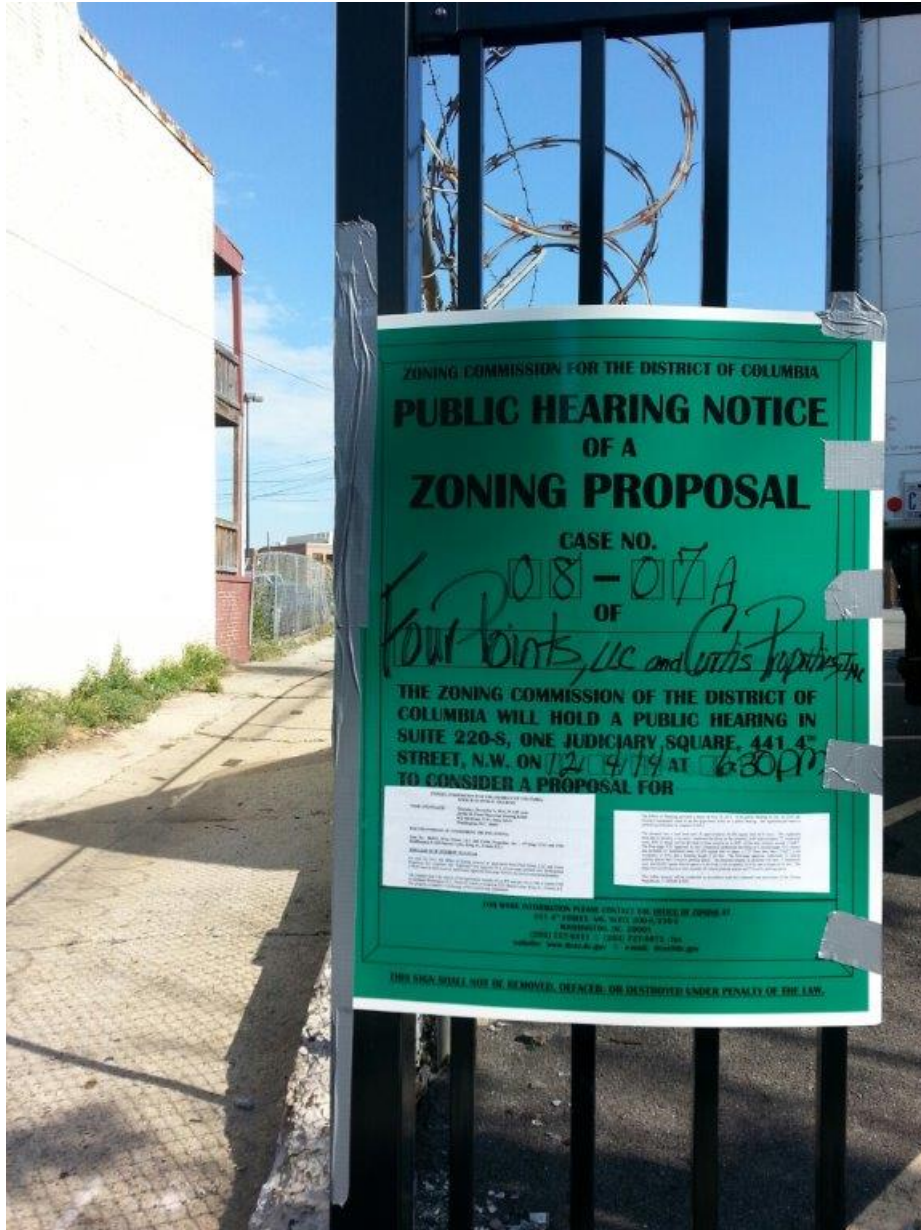
#5 ZC 08-07A Chicago Street, SE- Posted 10-21-14 at 12:1 pm