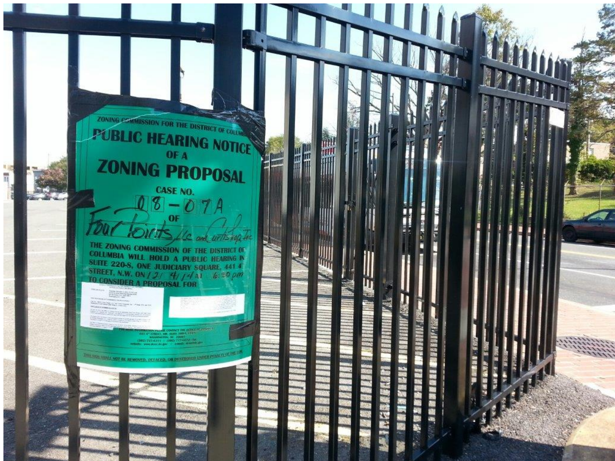
#3 ZC 08-07A - 2255 Martin Luther King Ave., SE- Posted 10-21-14 at 10:45 am