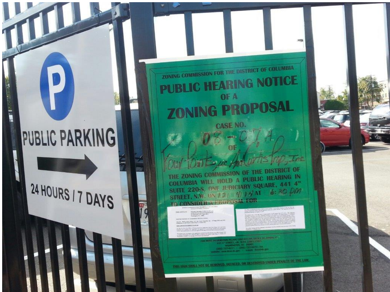
#4 ZC 08-07A Martin Luther King Ave., SE Posted 10-21-14 at 11:35 am