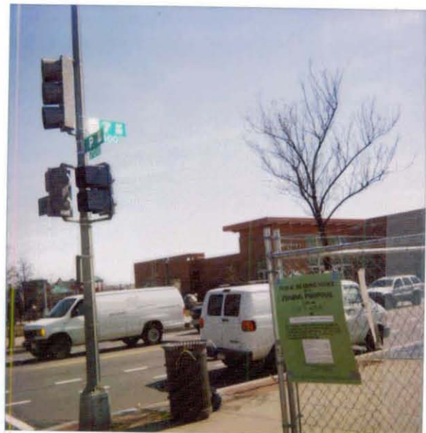
Corner of 7th and P Street NW 3/6/08 2C 07-26