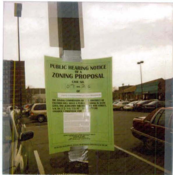
2/21/08 2C 07-26 700 Block of P Street NW