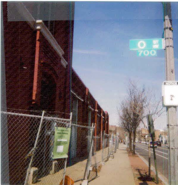
Corner of O Street and 7th Street NW 3/6/08 2C 07-26

2C 07-26 O Street Roadside LLC - Square 389, lots 829 ad 830