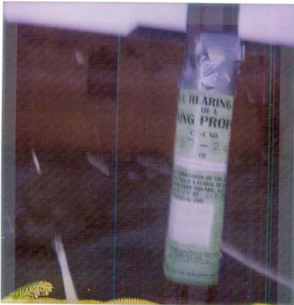
2/14/08 2C 07-26 700 Block of O Street NW

2C 07-26 O Street Roadside LLC Square 389, lots 829 and 830