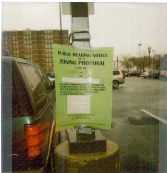
2/28/08 2C 07-26 700 Block of P Street NW