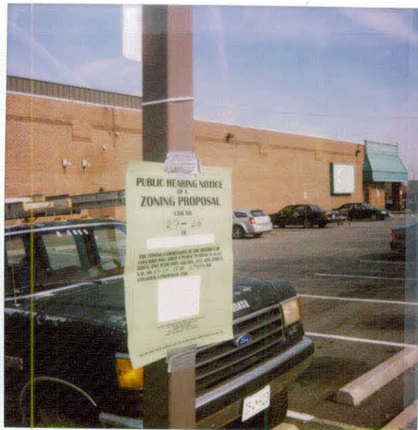
700 Block of O Street NW 2C 07-26 3/6/08