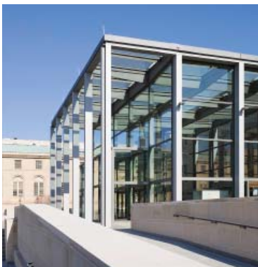
D.C. Courts 410 E Street NW, Washington, D.C.