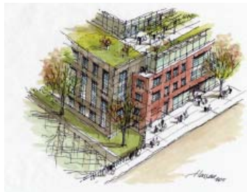
1055 Wisconsin Ave N.W., C&O Canal, Washington, D.C.