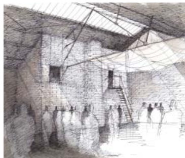
Red Star Line Museum of Immigration, Antwerp, Belgium