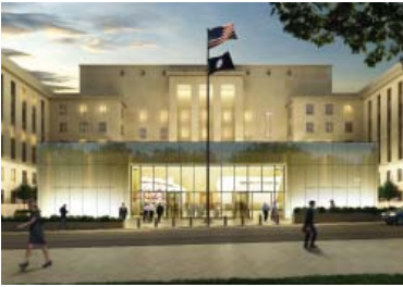
US Diplomacy Center, Washington, D.C.