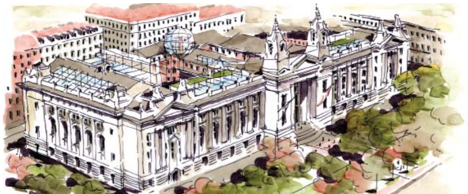
Exchange Palace, Budapest, Hungary