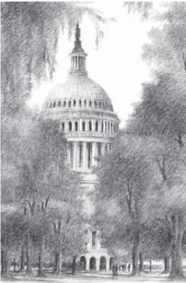
U.S. Capitol, Washington, D.C.