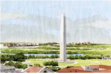
New Visitor's Center at the Washington Monument, Washington D.C.