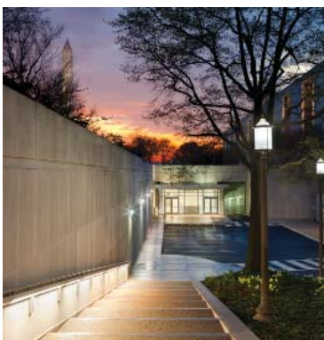
National Museum of American History, Smithsonian Institute, Washington, D.C.