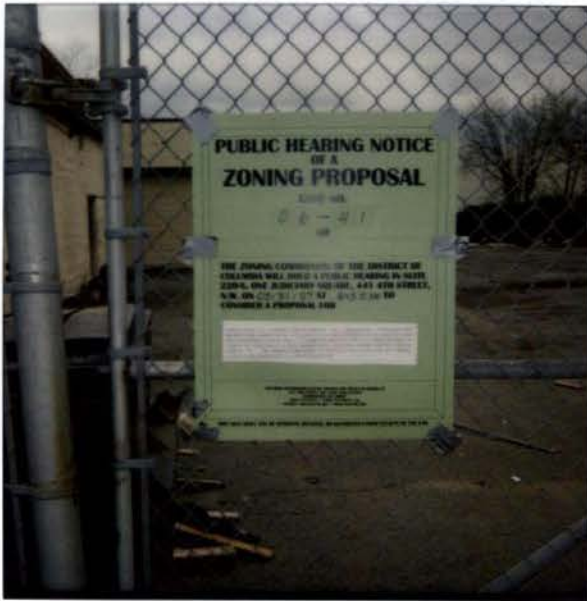
1 S. CAPITOL, SW 4-19-07