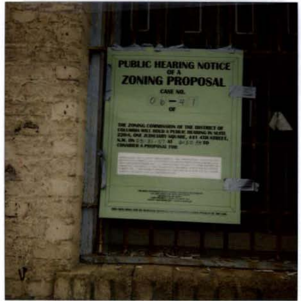
2 O STREET, SW 4-19-07