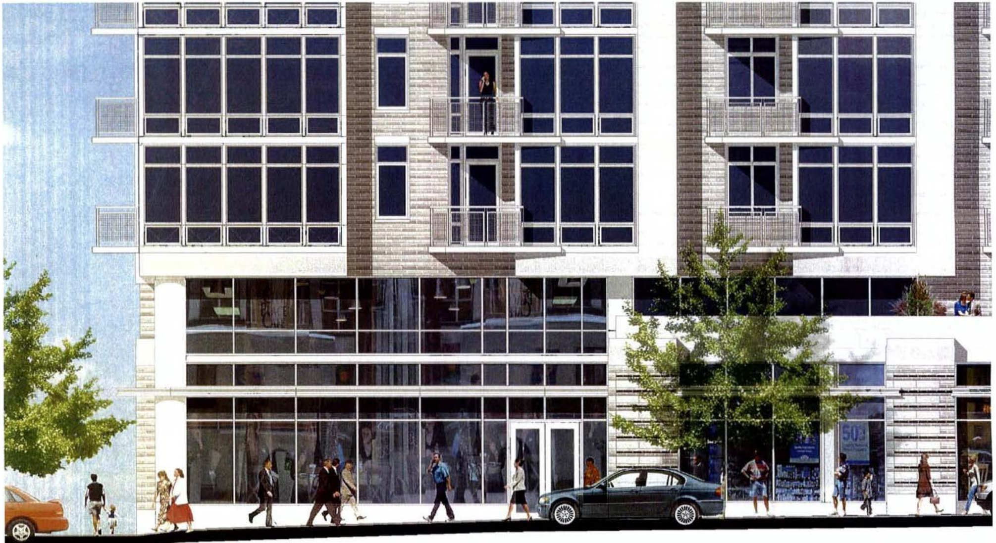
RETAIL CORNER ELEVATION ALONG S. CAPITOL ST.

1325 South Capitol Street SW Supplemental Zoning Submittal Scale: 3/16" = 1'-0" 03/07/07