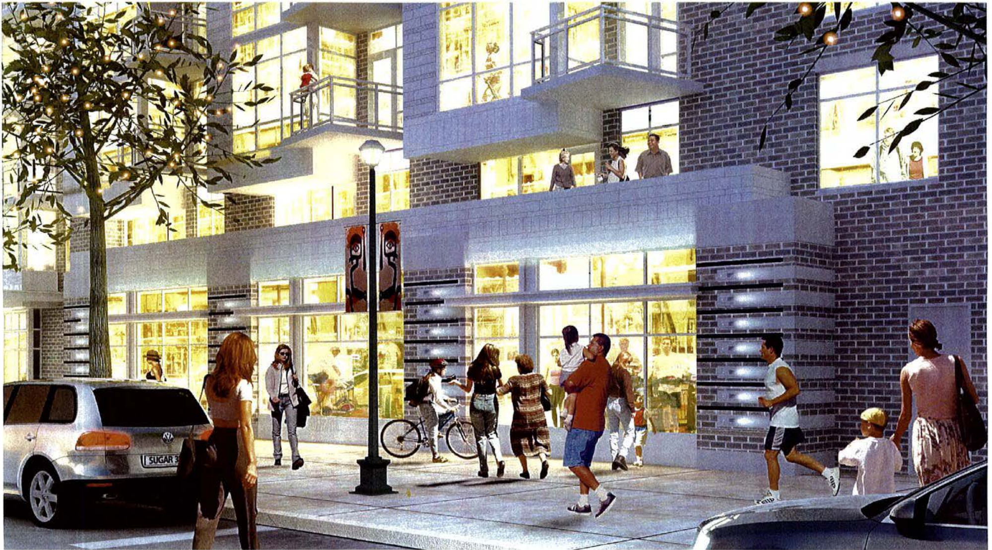
NORTH END PERSPECTIVE ALONG S. CAPITOL ST.

1325 South Capitol Street SW Supplemental Zoning Submittal 03/07/07