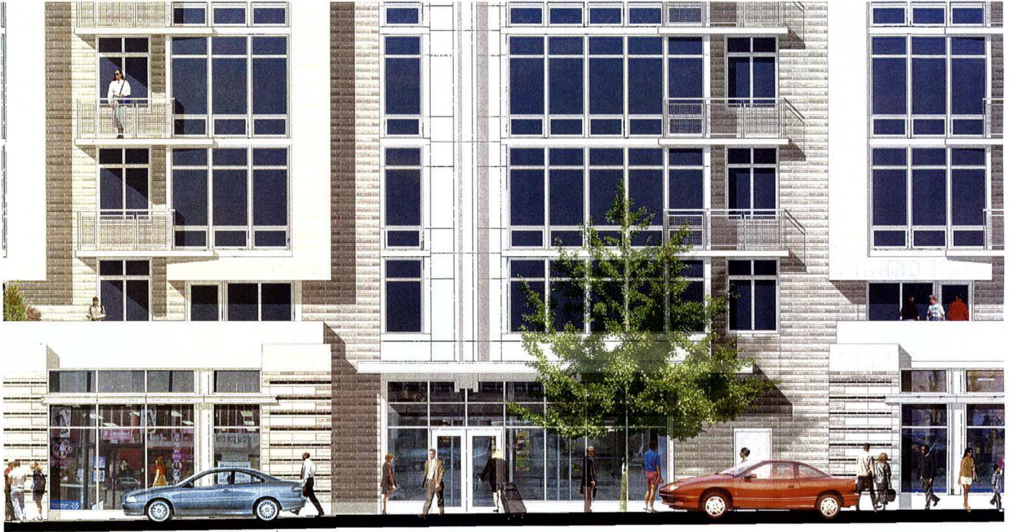
ENTRANCE ELEVATION ALONG S. CAPITOL ST.

1325 South Capitol Street SW Supplemental Zoning Submittal Scale: 3/16" = 1'-0" 03/07/07