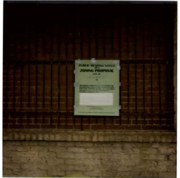
2 O STREET S.W. 1-9-07