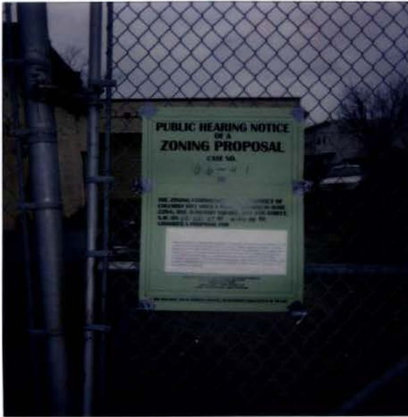
1 SOUTH CAPITOL ST 1-9-07