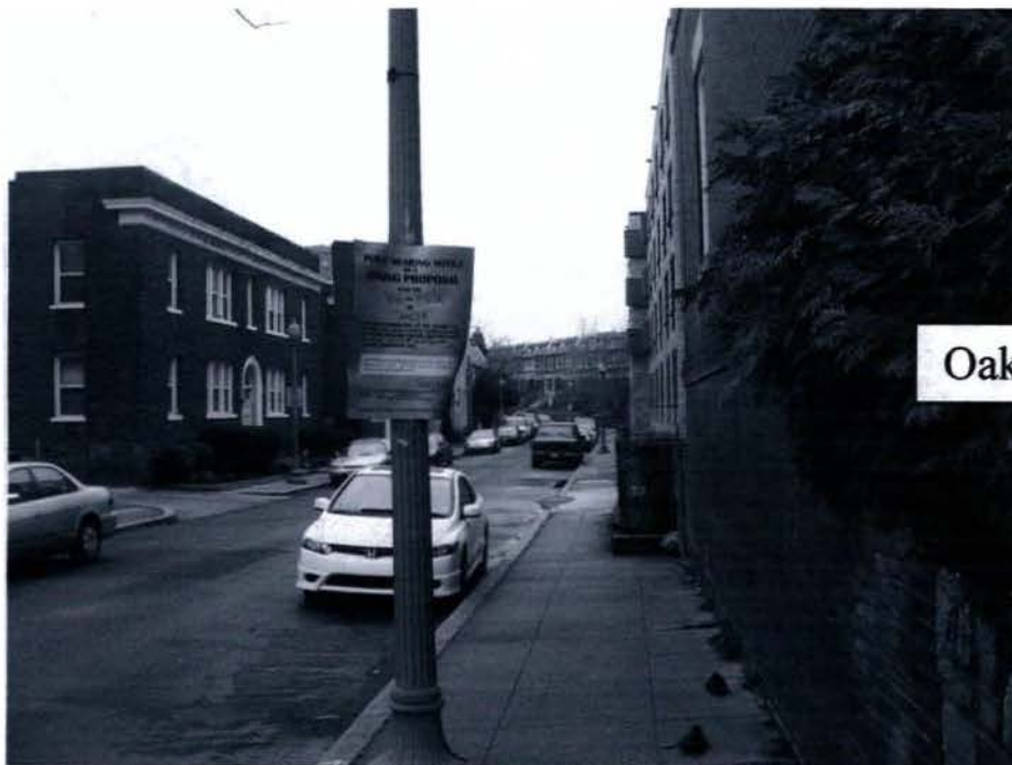
Oak Street at Center Street, NW