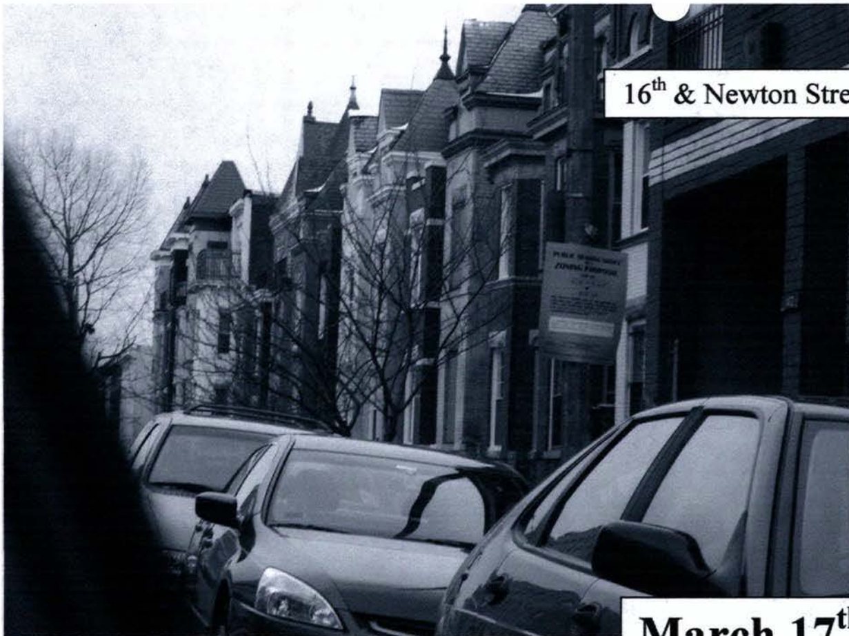
16 th & Newton Streets, NW