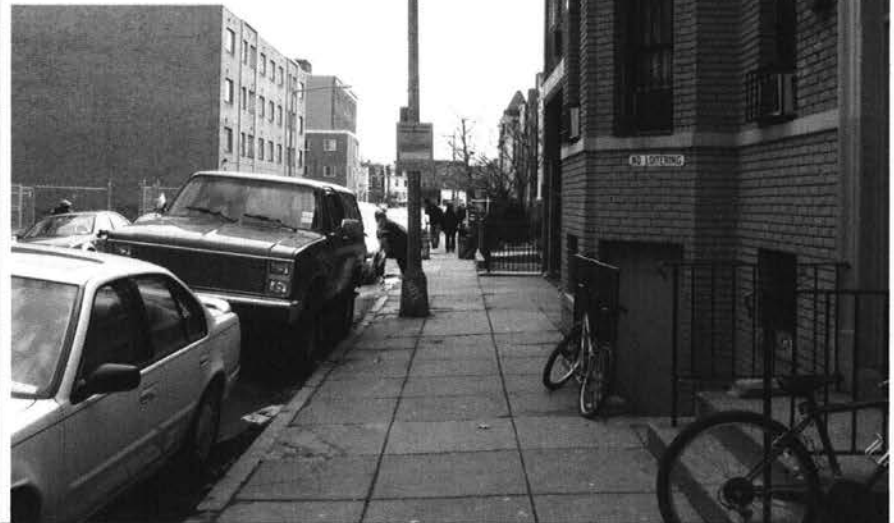
16 th & Monroe, NW