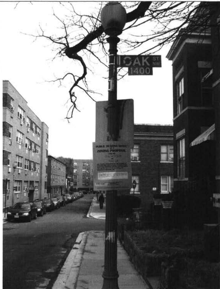
Center Street at Oak Street, NW