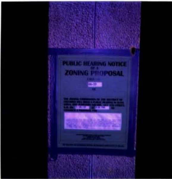
1 25 TH STREET, NW 2-8-07