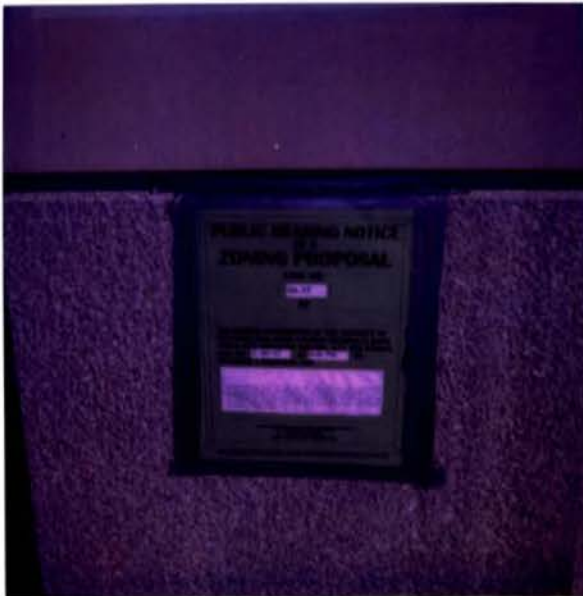
3 25 TH STREET, NW 2-8-07