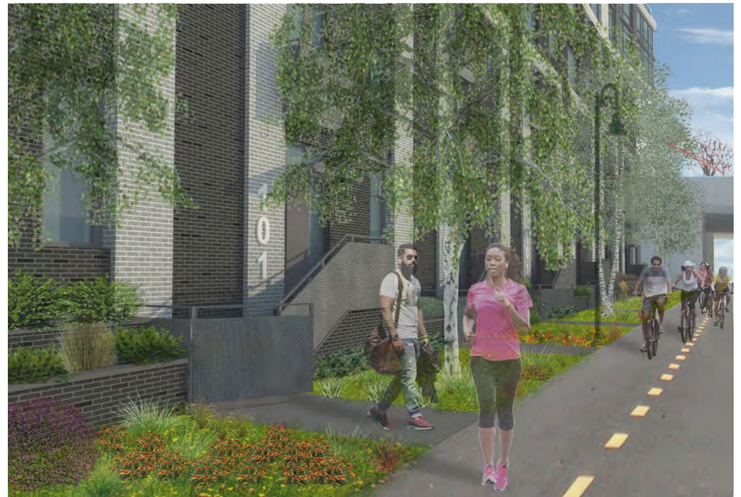
PERSPECTIVE OF NORTH TOWER, LOOKING NORTHEAST ALONG MBT