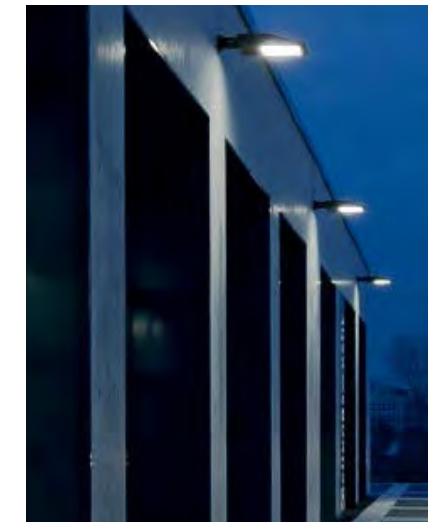
South Tower Building Light along MBT

Note: Building lights along MBT are shown to provide general character of light fixtures and are not necessarily the final selection.