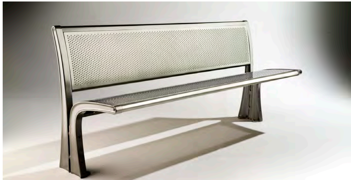
Landscape Forms Stay Bench