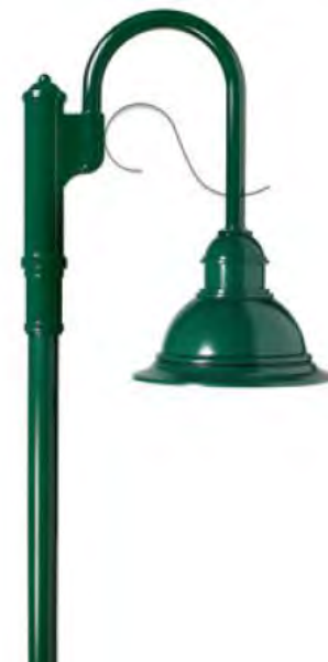
Domus Series Pole Light for MBT