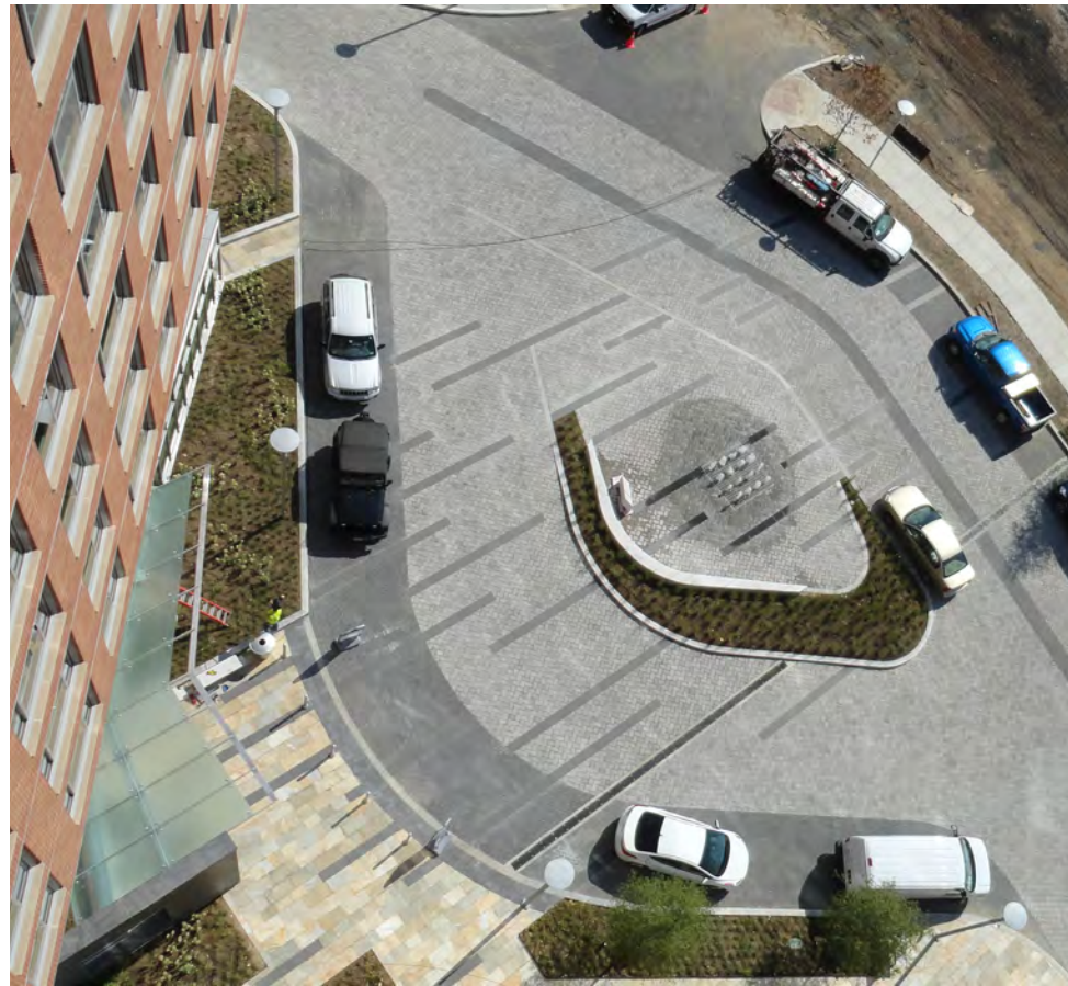
Plaza and sidewalk paving