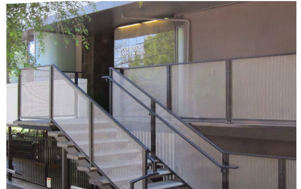
METAL RAILING WITH MESH INFILL