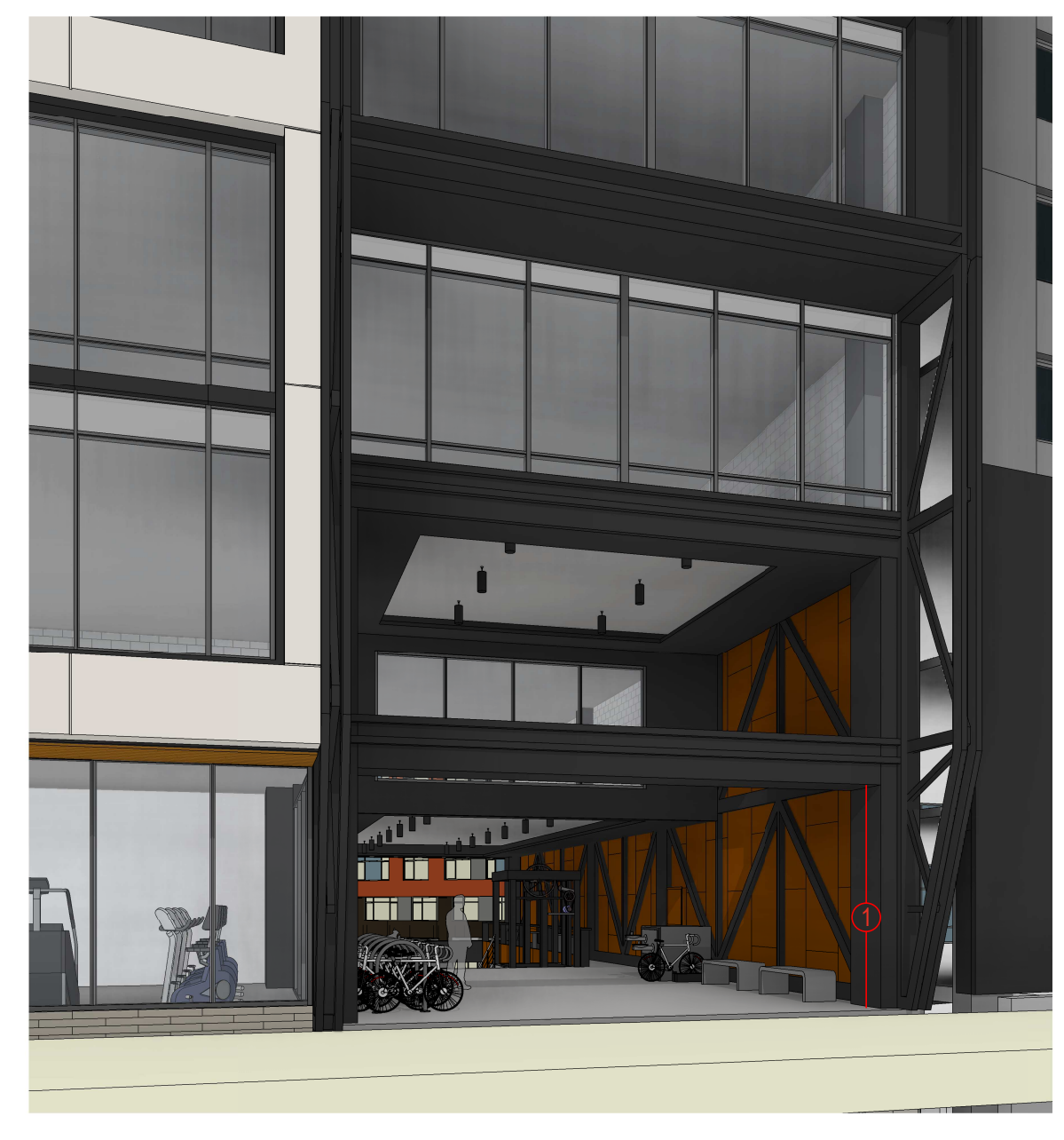
VIEW 2 TRAIL SIDE