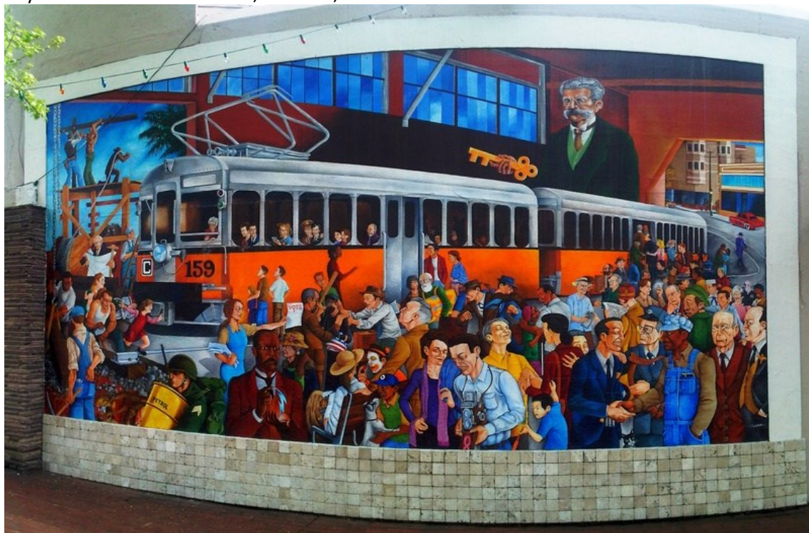
Bill FitzGibbons, Light Rails, Birmingham, Alabama