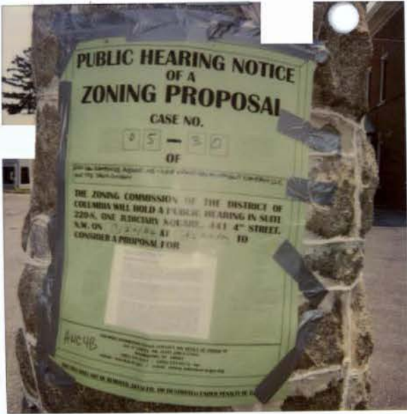
6/12/06 5110 Mill Road NE Replaced