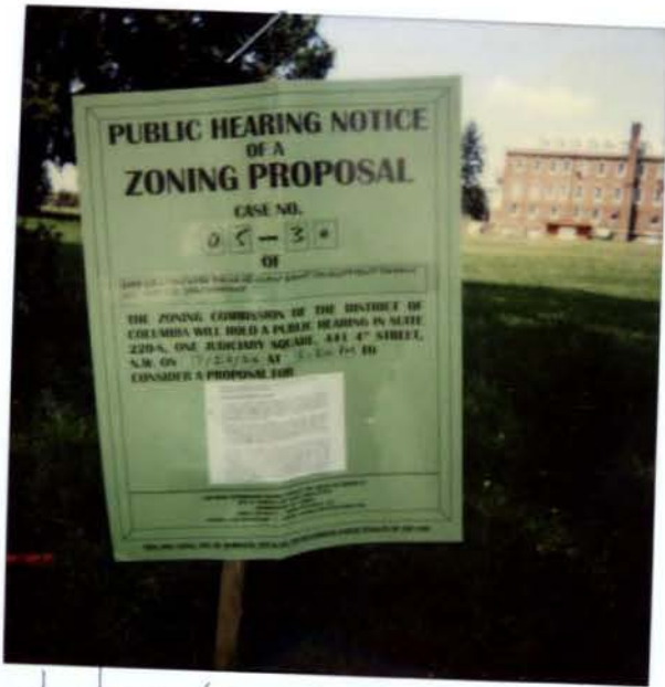
7/7/06 6000 New Hampshire Avenue NE Replaced