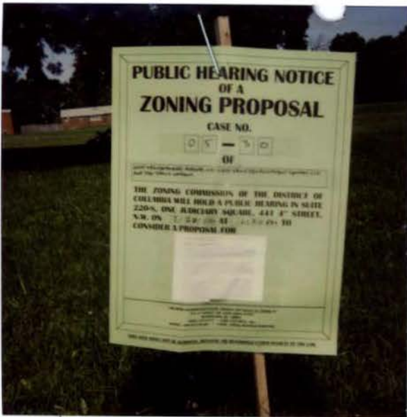
7/7/06 6000 New Hampshire Ave NE Replaced