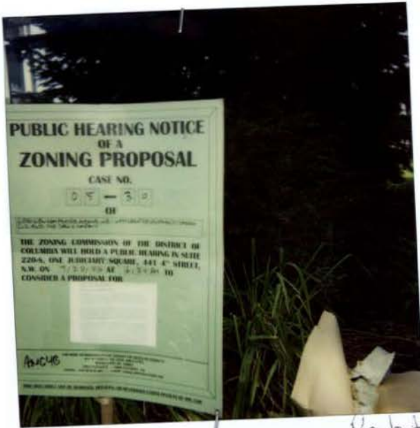
6/28/06 6000 New Hampshire Avenue NE Replaced