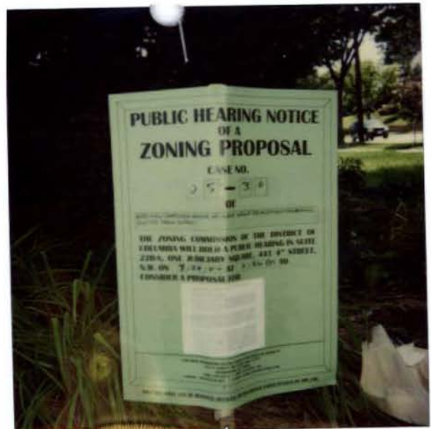
7/7/06 6000 New Hampshire Avenue NE and Replaced Peabody St NE