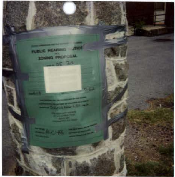
6/22/06 5110 Mill Road NE Replaced