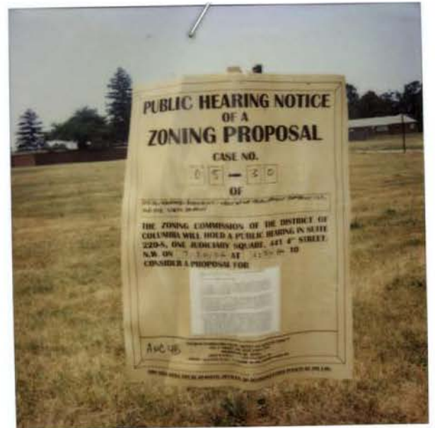
7/3/06 6000 New Hampshire Avenue NE Replaced