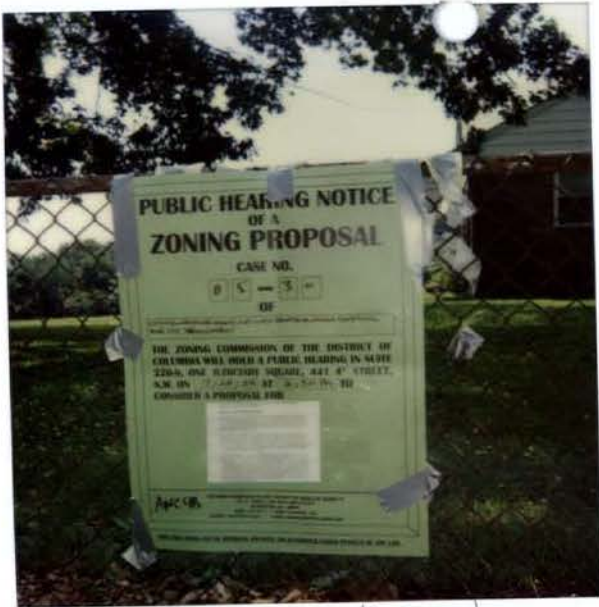
6/26/06 Sling Mill Road NE Replaced