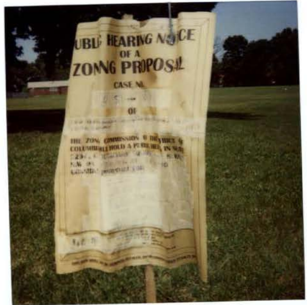
6/28/06 6000 New Hampshire Avenue NE Replaced