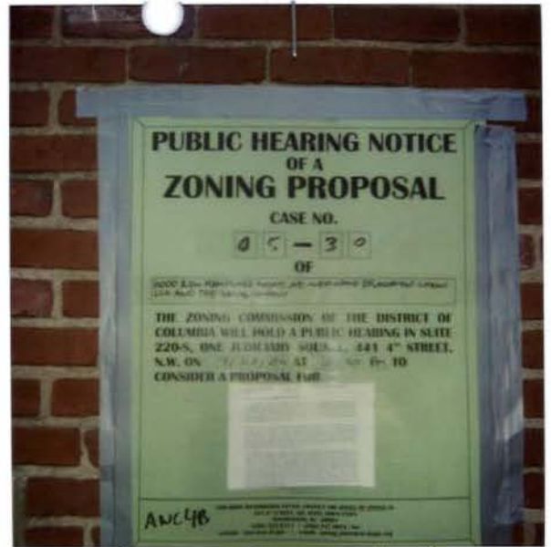
6/28/06 Sling Mill Road NE Replaced + Chillum Place NE