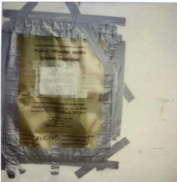
6/28/06 Chillum Place NE Replaced