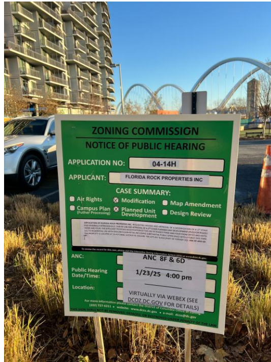
1. 12/9/24 Potomac Avenue SE