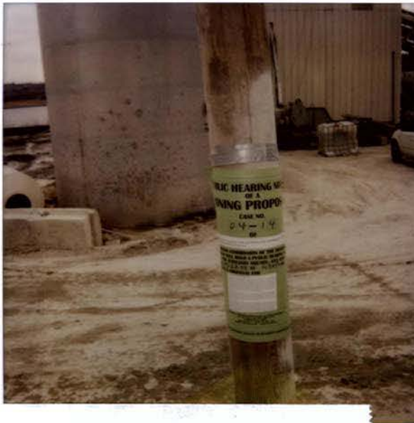
2C 04-14 2/29/08 100 Polaron Avenue, SE