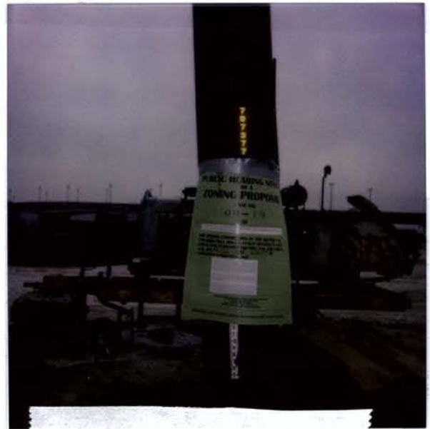
2C 04-14 2/29/08 100 Polaron Ave SE