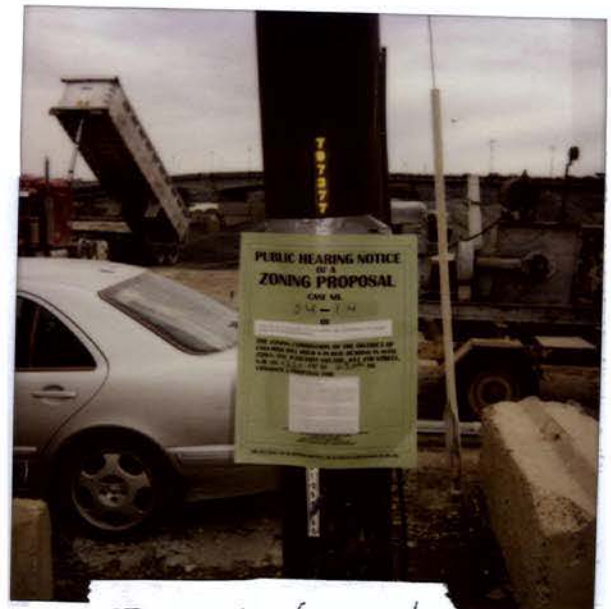
2C 04-14 3/7/08 100 Polaron Avenue SE

2C 04-14 Second-stage PUD and Rebated Map Amendment for 100 Polaron Avenue SE for Florida Rick Properties