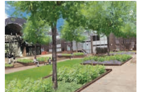
RIVER PARK PROJECT