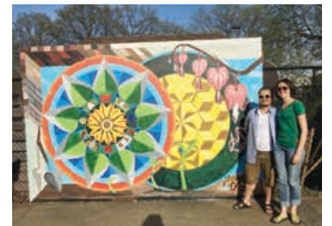
EARTH, ARTS, AND MUSIC DAY AT COMMUNITY GARDENS