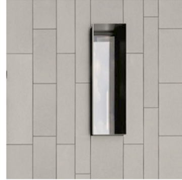
B ARCHITECTURAL RAINSCREEN PANEL SYSTEM