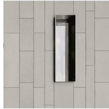
B ARCHITECTURAL RAINSCREEN PANEL SYSTEM