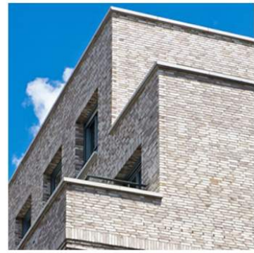
A BRICK MASONRY