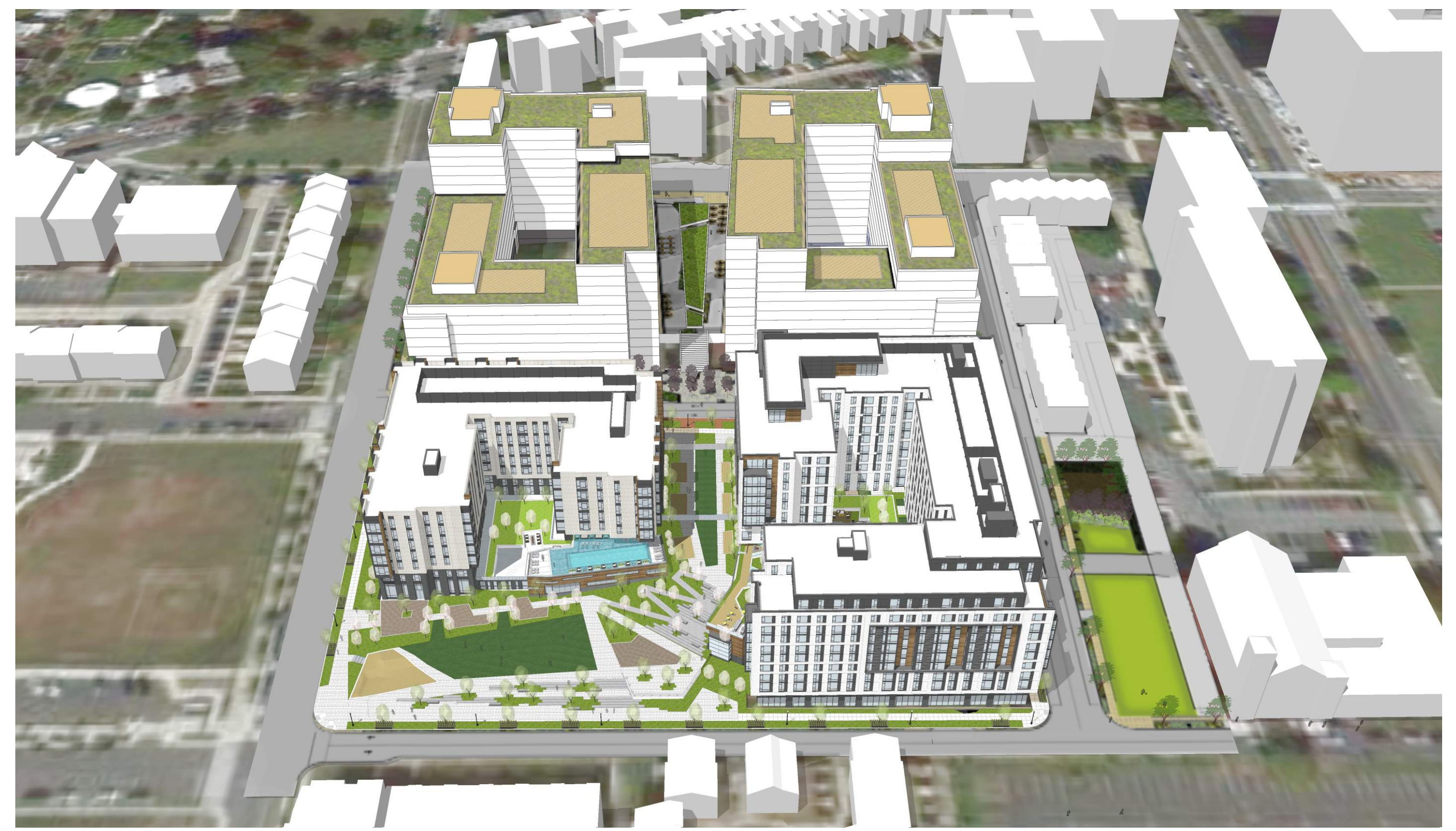
Note: The building massing is shown for illustrative purposes. The design of the buildings will be subject to a future second stage planned unit development design review and approval.