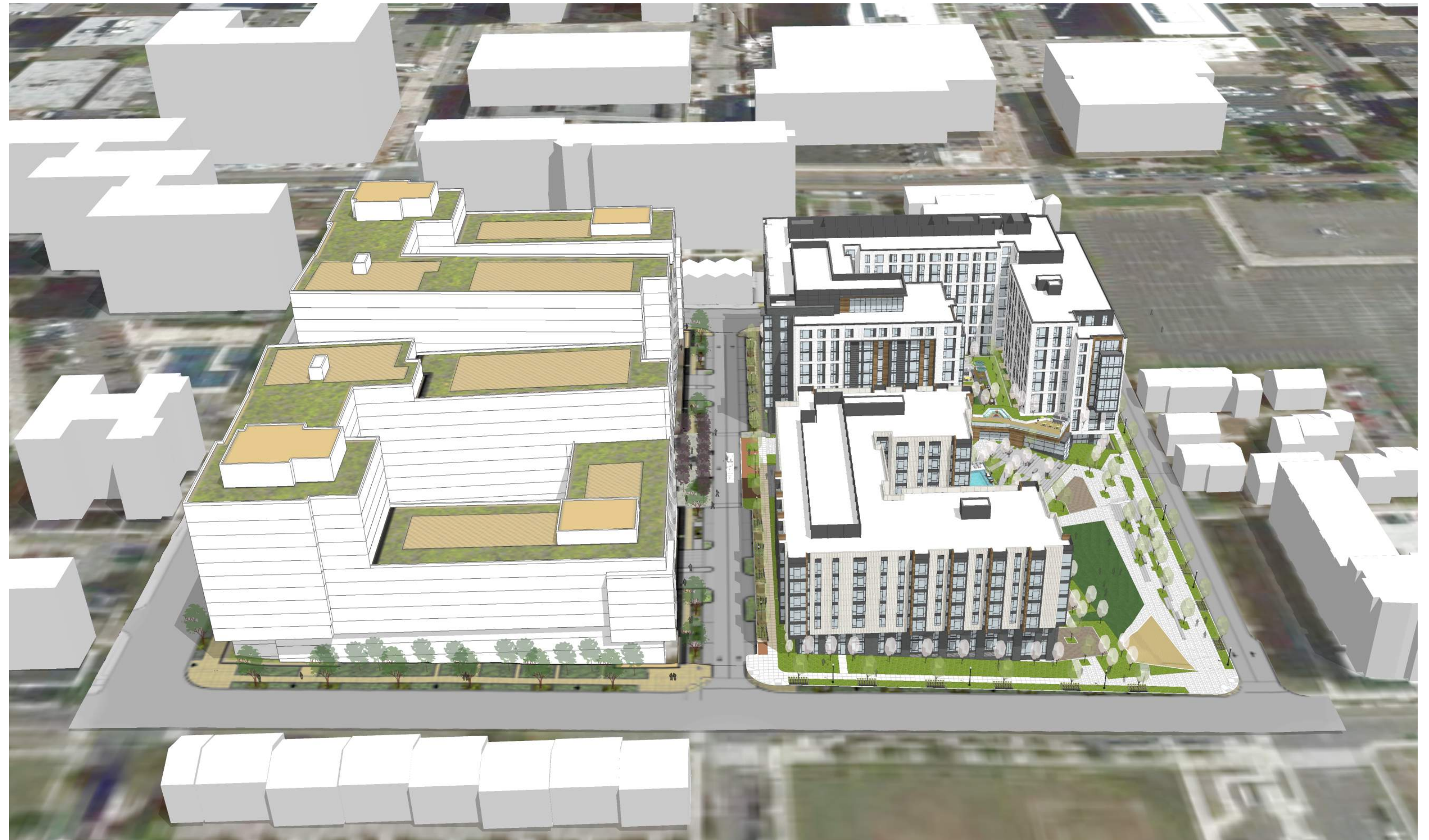
Note: The building massing is shown for illustrative purposes. The design of the buildings will be subject to a future second stage planned unit development design review and approval.