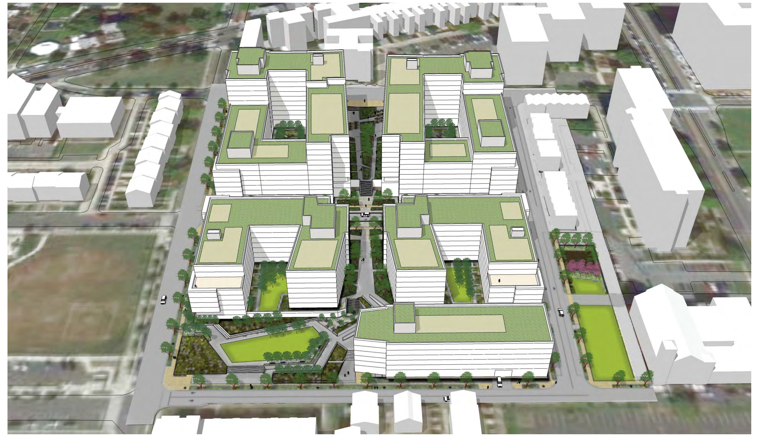
Note: The building massing is shown for illustrative purposes. The design of the buildings will be subject to a future second stage planned unit development design review and approval.