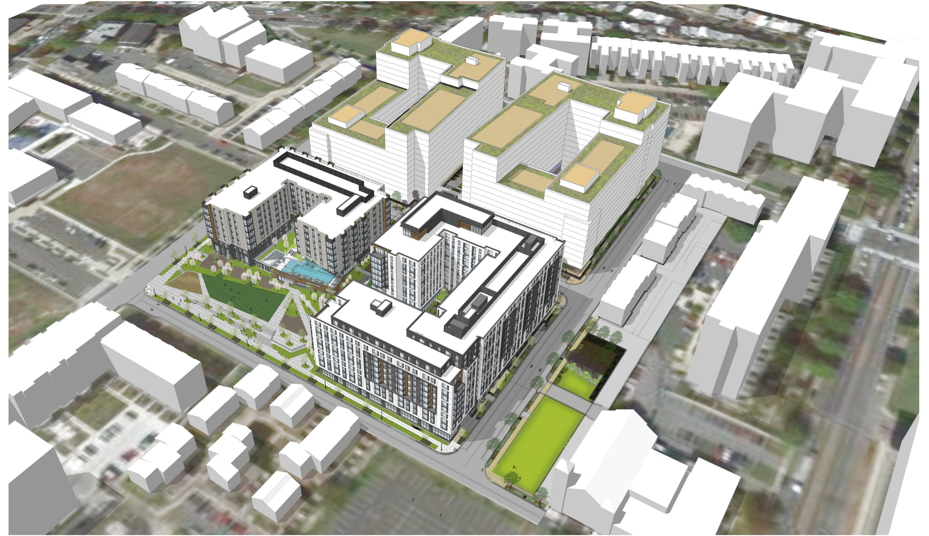
Note: The building massing is shown for illustrative purposes. The design of the buildings will be subject to a future second stage planned unit development design review and approval.