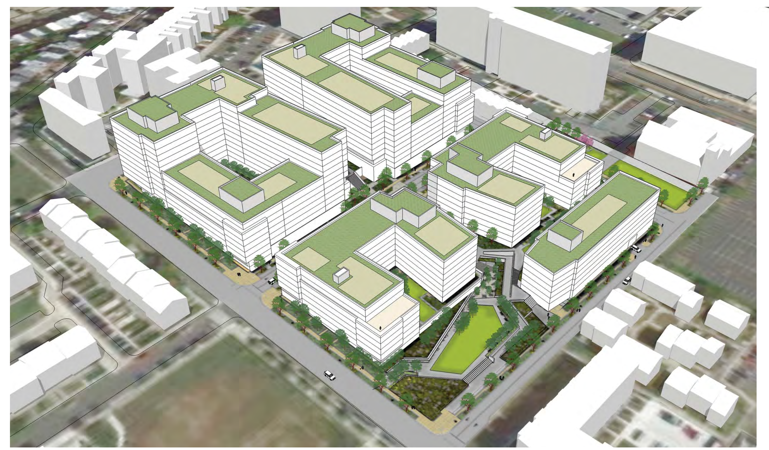
Note: The building massing is shown for illustrative purposes. The design of the buildings will be subject to a future second stage planned unit development design review and approval.