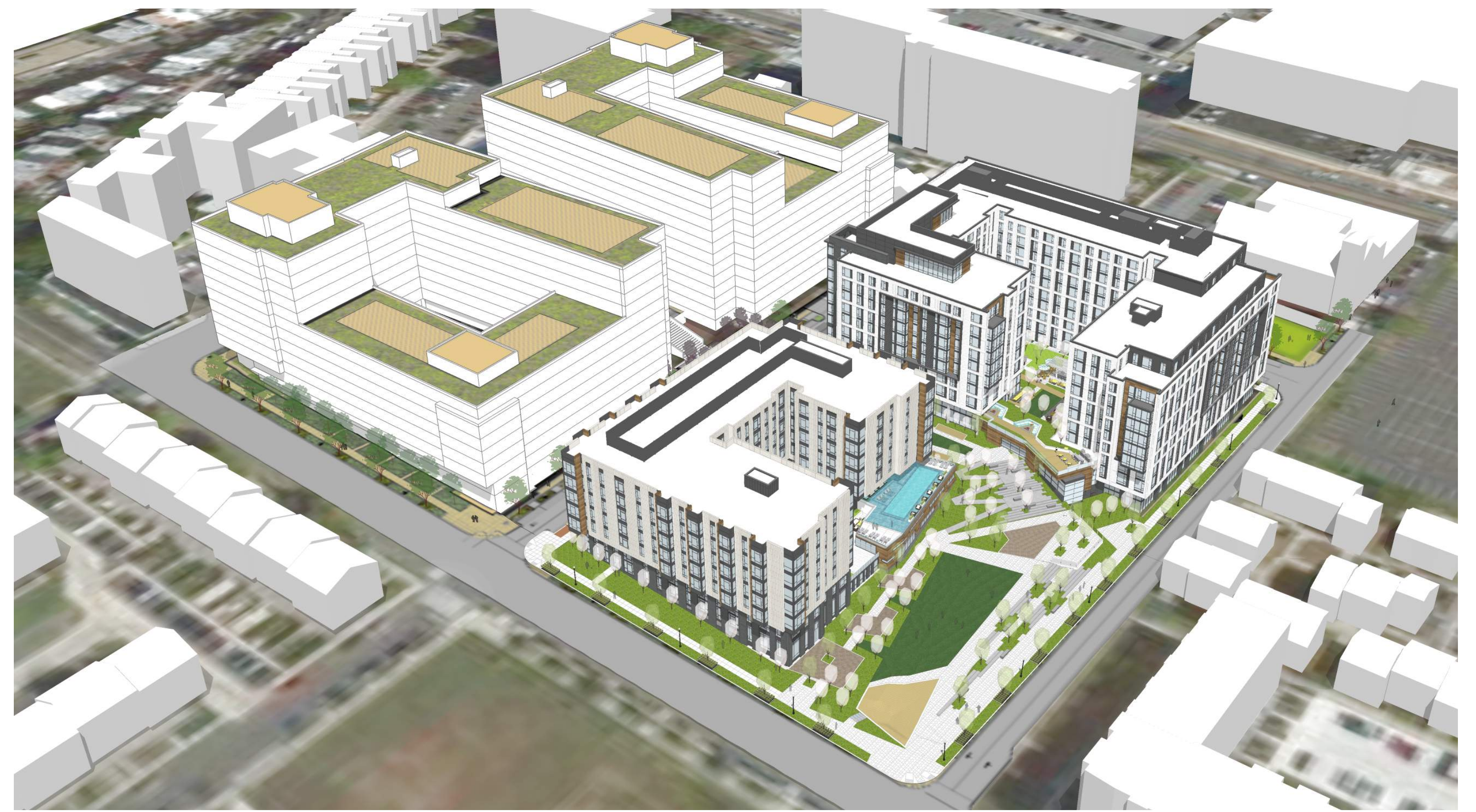
Note: The building massing is shown for illustrative purposes. The design of the buildings will be subject to a future second stage planned unit development design review and approval.