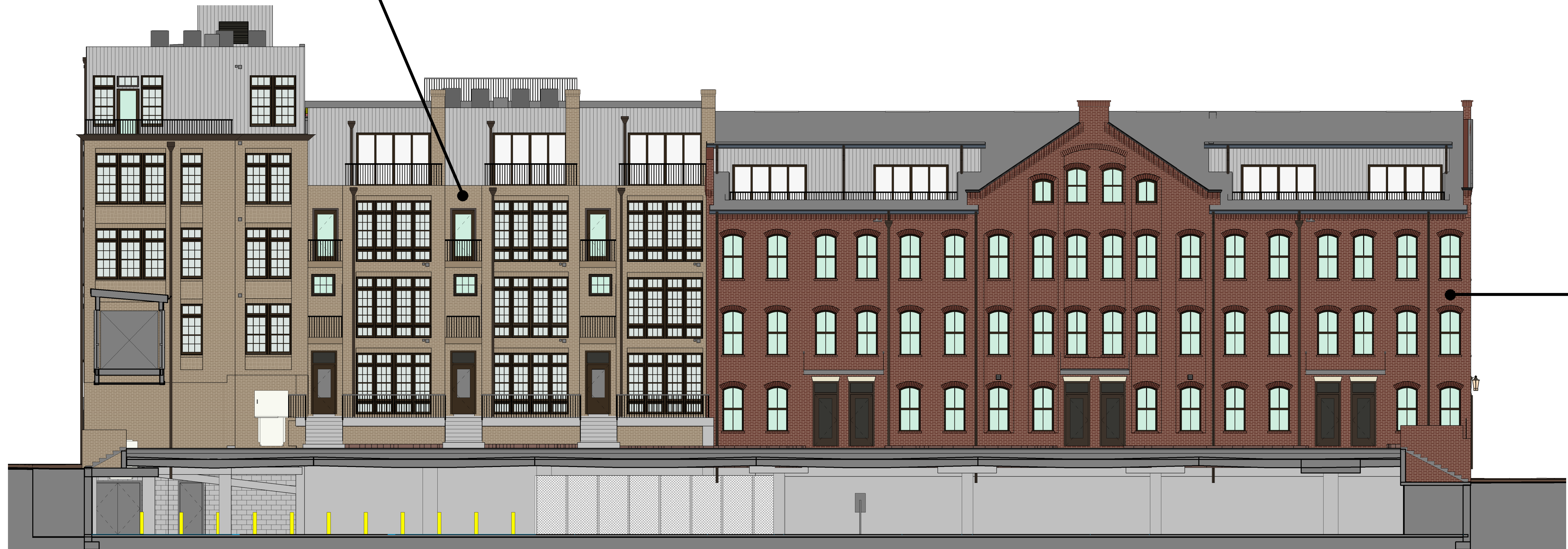
2 BUILDING 3 - SOUTH 1/8" = 1'-0"