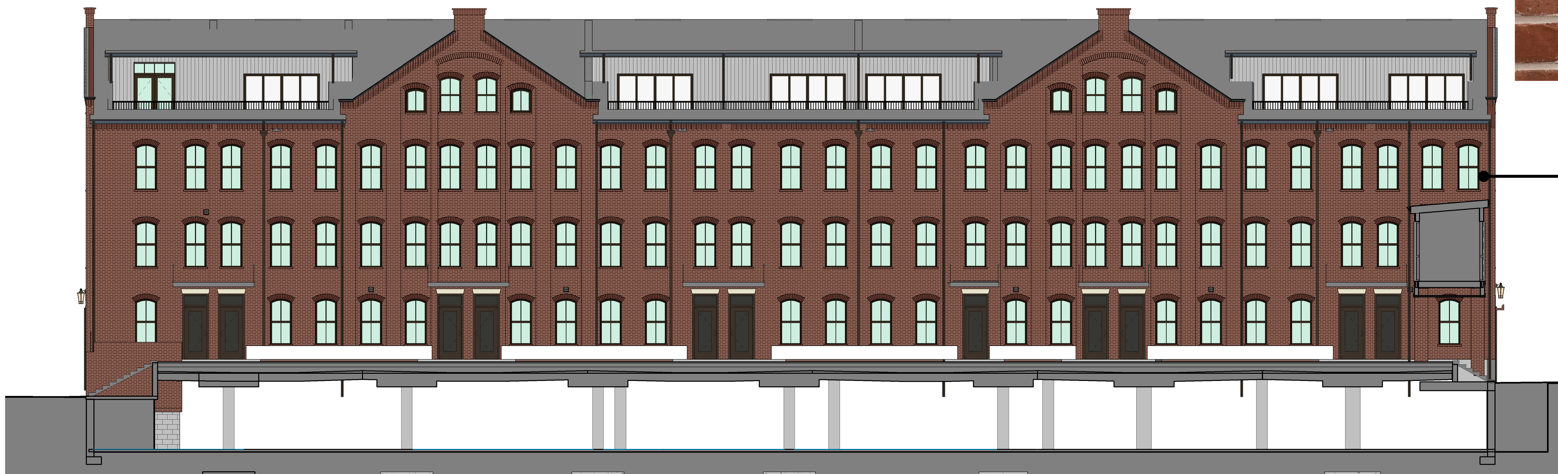
1 BUILDING 4 - NORTH 1/8" = 1'-0"