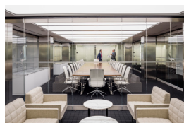
Morgan, Lewis & Bockius LLP