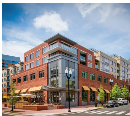
2001 Clarendon Blvd