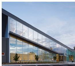
Transurban Hot Lanes Center