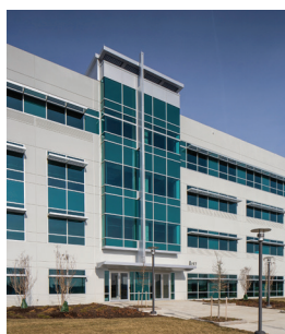
Konterra AJBP 7