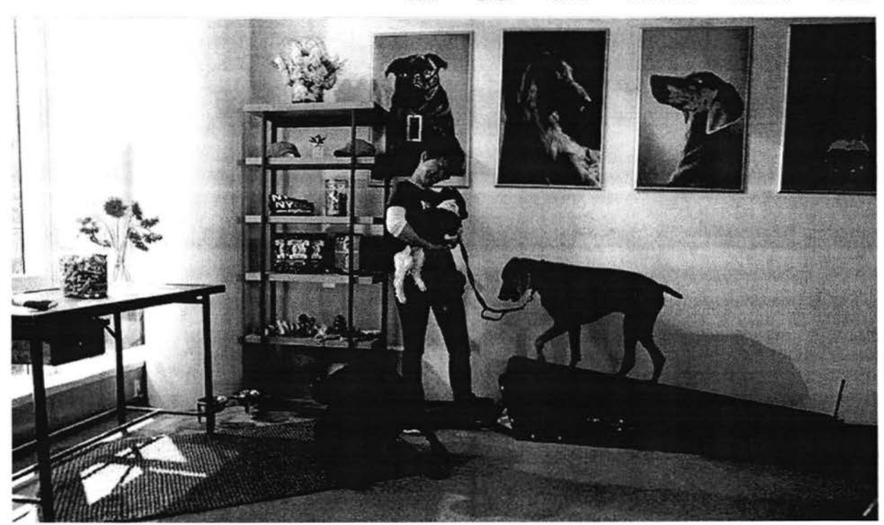
Related Companies' MiMA high rise has Dog City on the third floor, offering specially designed indoor and outdoor play spaces, along with dog services ranging from veterinary care to grooming and massaging.

Print Email Share Facebook LinkedIn Twitter