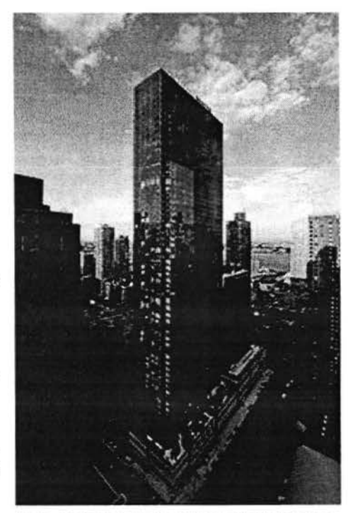
At the MiMa highrise in midtown Manhattan, the Dog City complex, which offers a variety of services, helps attract pet-loving tenants.

Pet accommodations, like any amenity, do incur extra upfront investments and maintenance costs. Some buildings add insulation between walls and floors to muffle pet noises, particularly barking, and a grooming room with a tub and running water can cost a few thousand