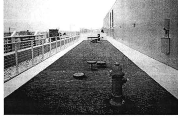
City Market at O apartments in Washington, D.C., have a 200-f00t-long (60 m) rooftop dog park with a water fountain and fire hydrant.

Welcome to a new frontier in multifamily housing: pet-friendly accommodations. Cities have been developing dog parks for years, and the retail industry has long catered to our four-legged friends with doggy daycare, dog clothing, and even yoga classes that people can take with their dogs. Finally, the real estate industry is beginning to catch up. Apartment and condominium developers from New York City to Washington state are incorporating pet amenities like grooming stations, day boarding facilities, dogwalking services, veterinary clinics, miniature dog parks, and even rooftop dog walks with special cleaning systems.