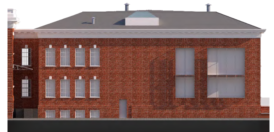
WEST WING NORTH ELEVATION