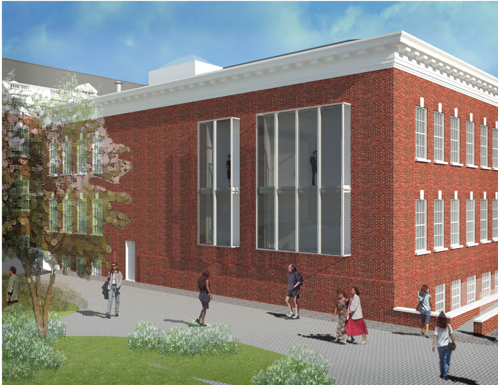
WEST WING NORTH ELEVATION