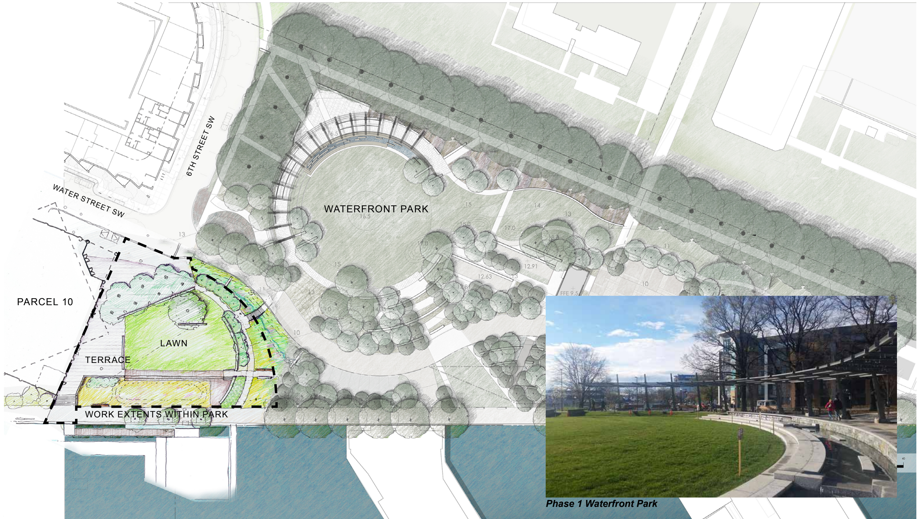
Phase 1 Waterfront Park