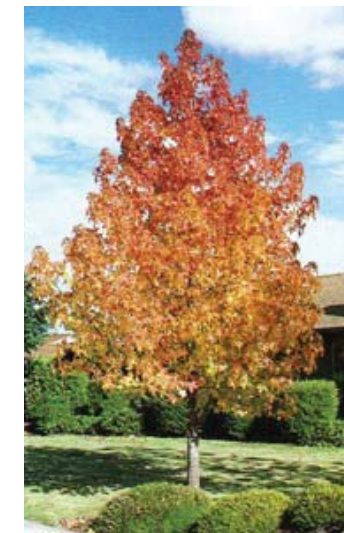
Street tree along O Street - Sweetgum.