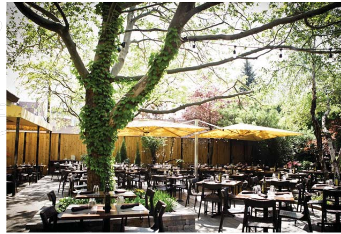
Precedent image for proposed cafe seating area under trees.