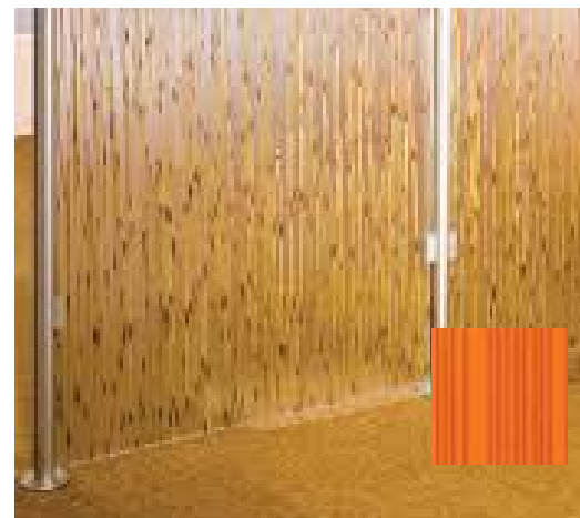
Precedent image of art or special fencing at lobby entrance