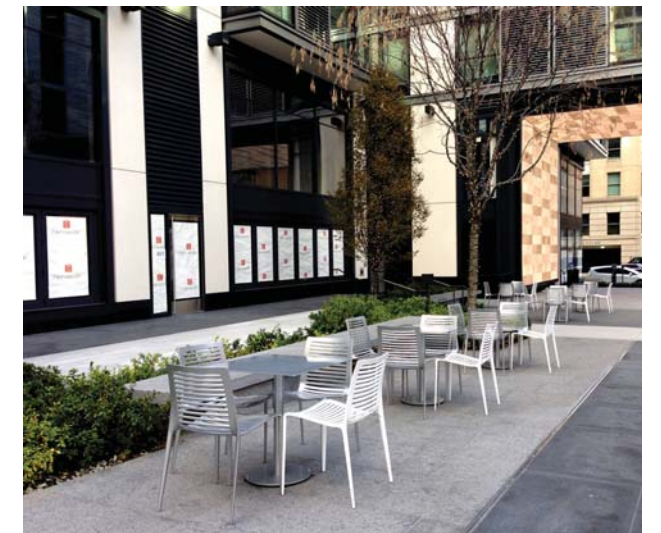
Precedent image of tables and chairs and ornamental tree.