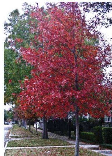
Street tree along 8th Street - Red Oak.